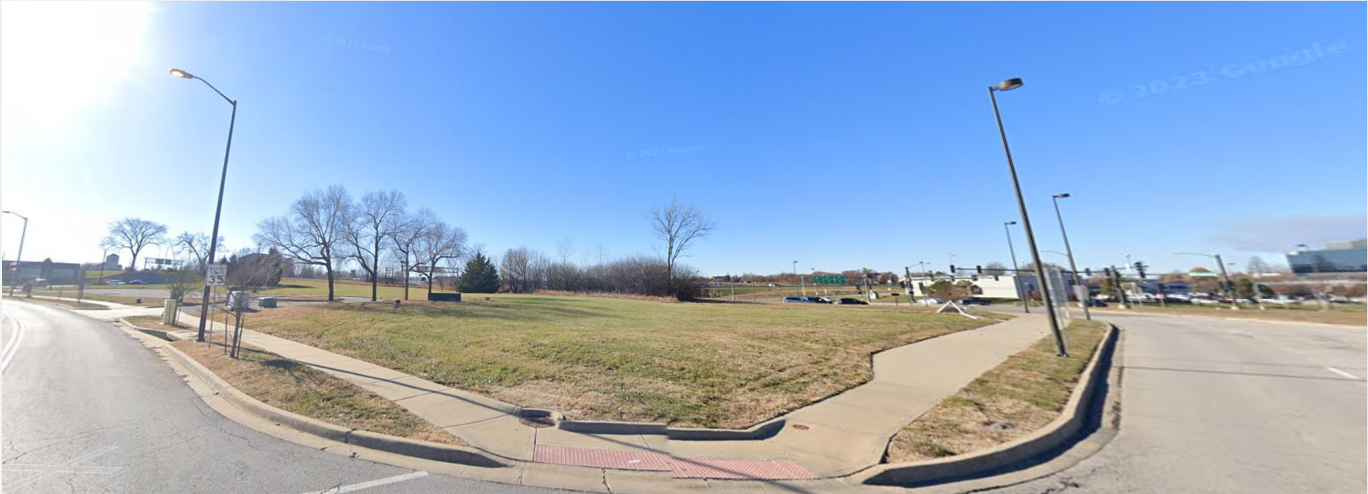
View from the corner of NW Tiffany Springs Parkway and N Polo Drive