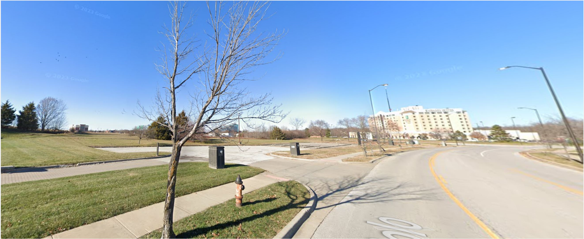
View from N Polo looking North