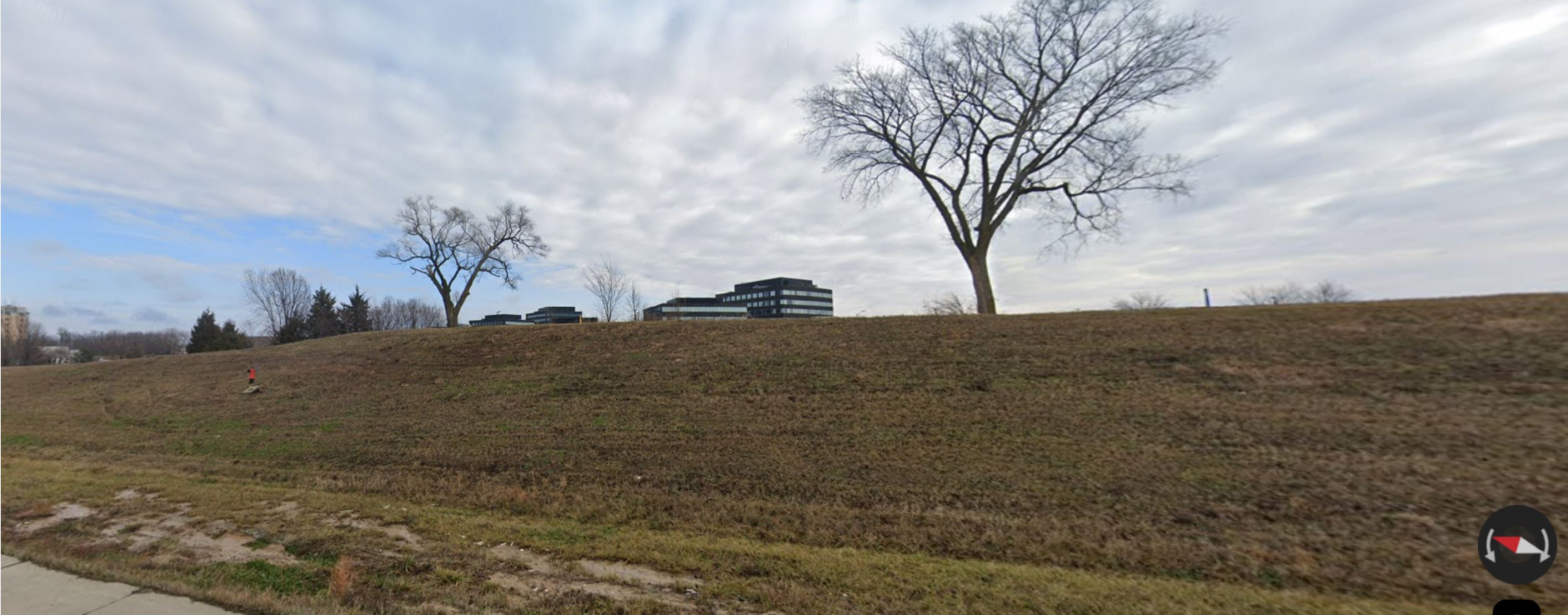
View from the I-29 off ramp