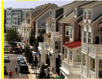
On a Boulevard or within a Development Node