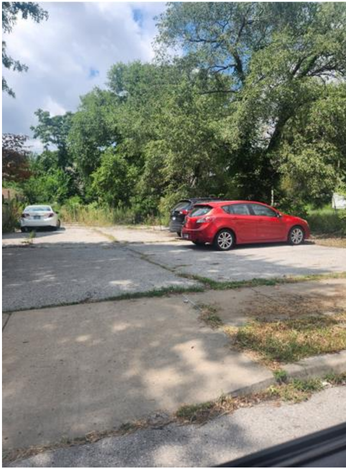
Illegally parked vehicles trespassing on-site