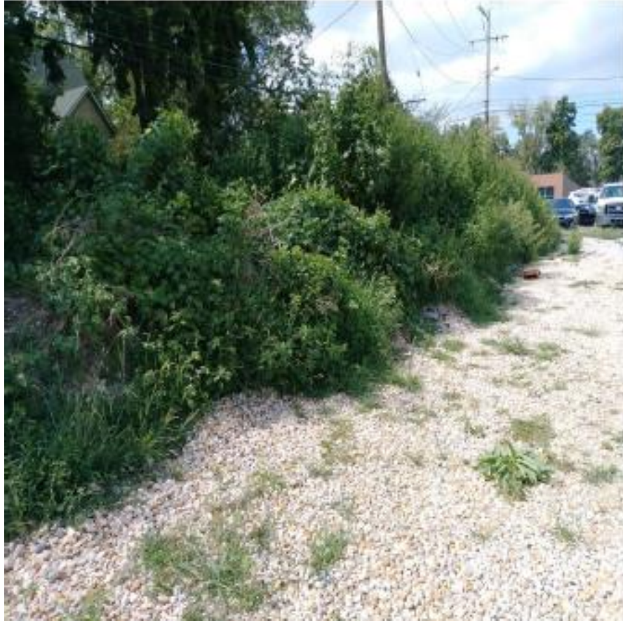
Topsoil scraped to west alley r.o.w.; overgrown weeds, saplings, trash & debris