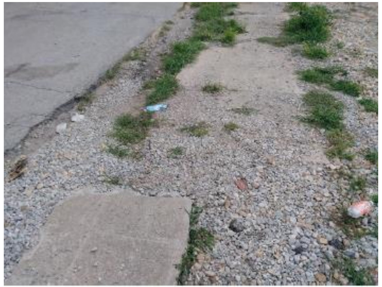
Deteriorated sidewalk; broken & missing curb & gutter; scattered litter