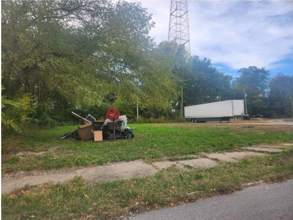
Illegal dumping & illegally parked semi-trailer trespassing on-site