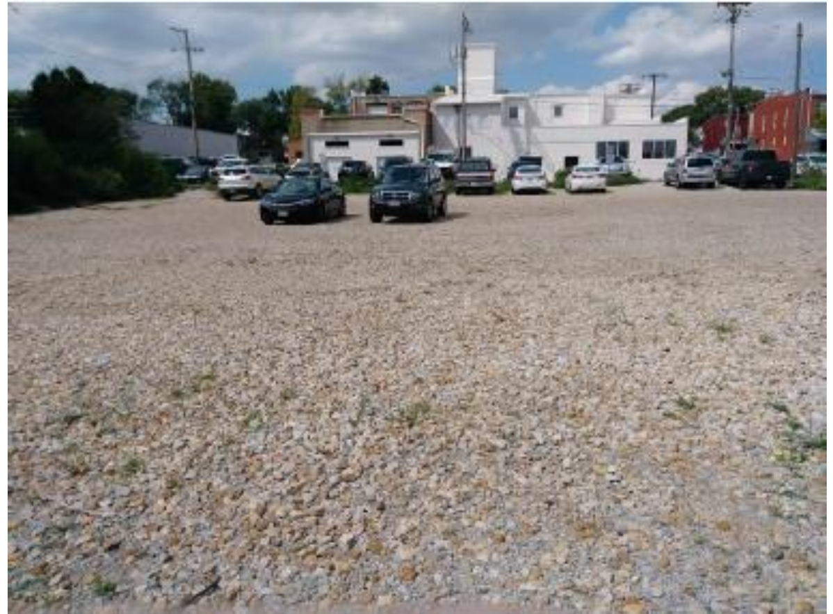
Unpaved parking; lack of stormwater control, landscaping & lighting in parking area