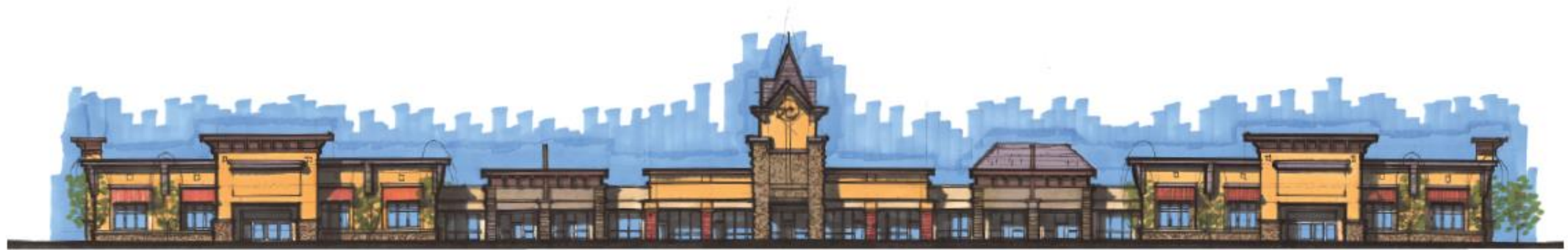
VALLEY VIEW SHOPPE'S FRONT ELEVATION