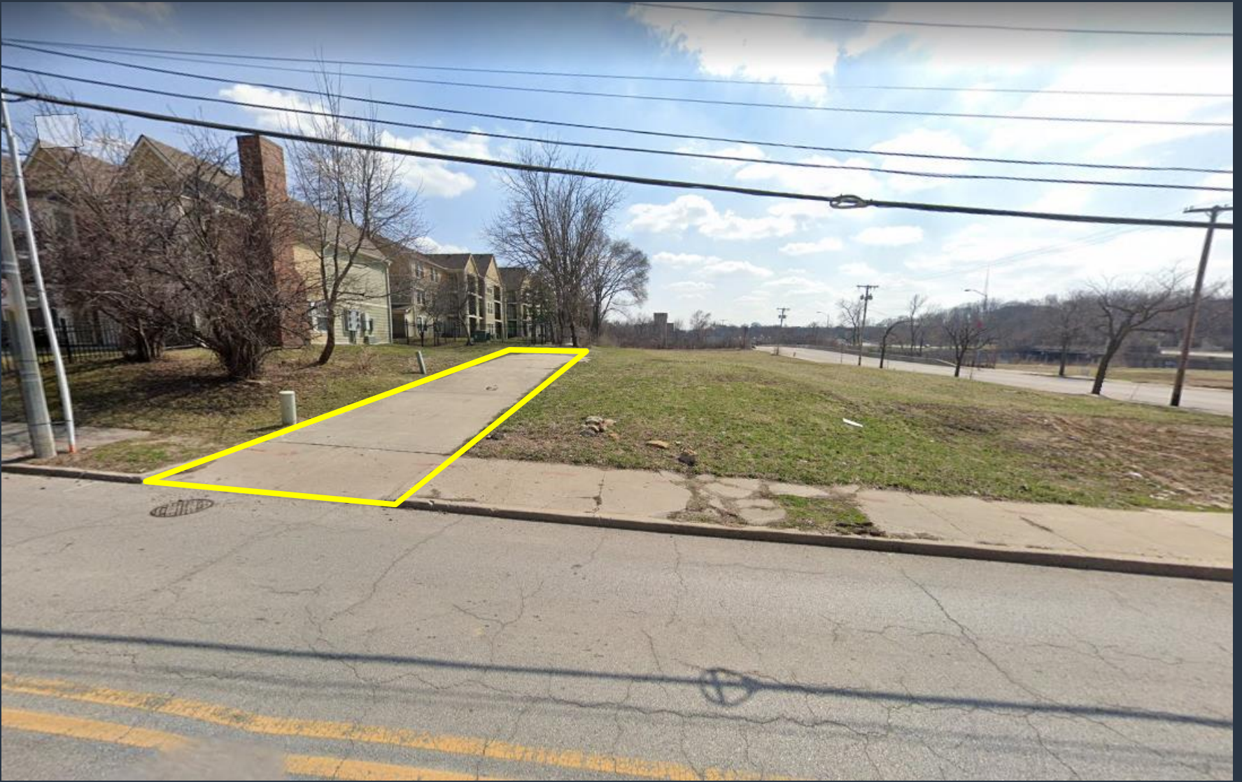
View looking south from E 19 th St