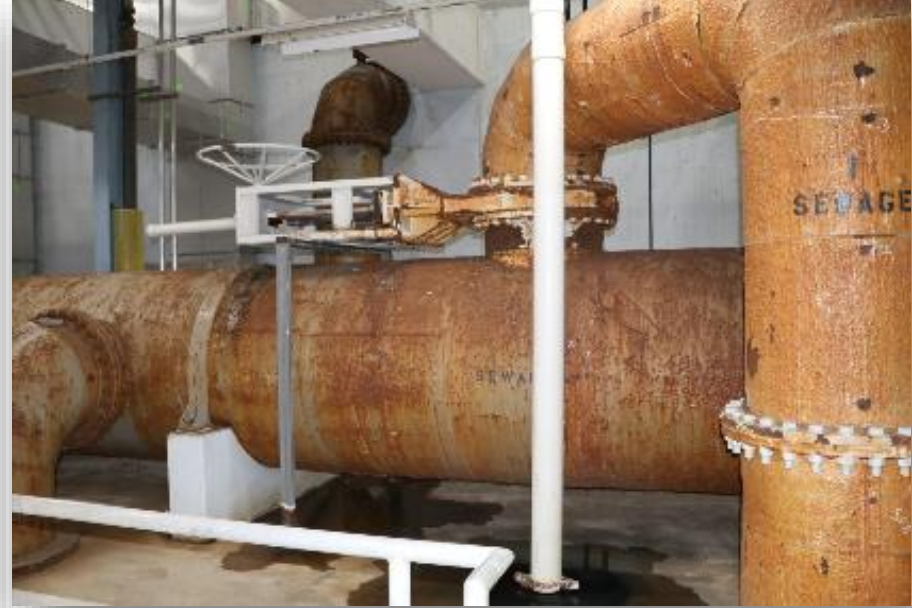
Header Piping to be Repainted