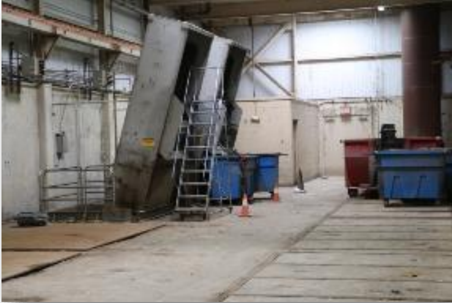
Trash Removal System at the Birmingham Pump Station