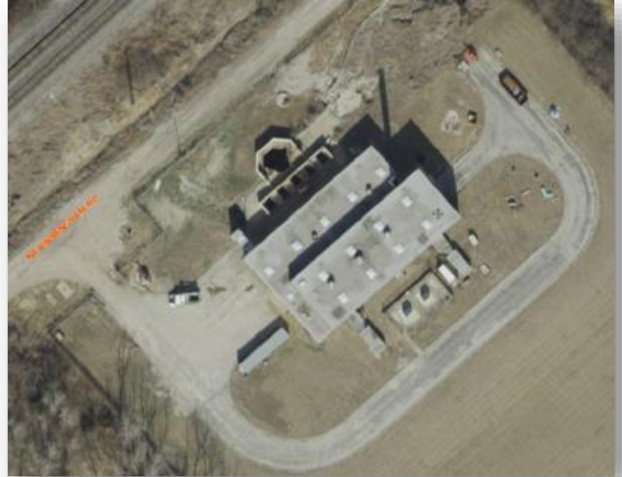
Birmingham Pump Station