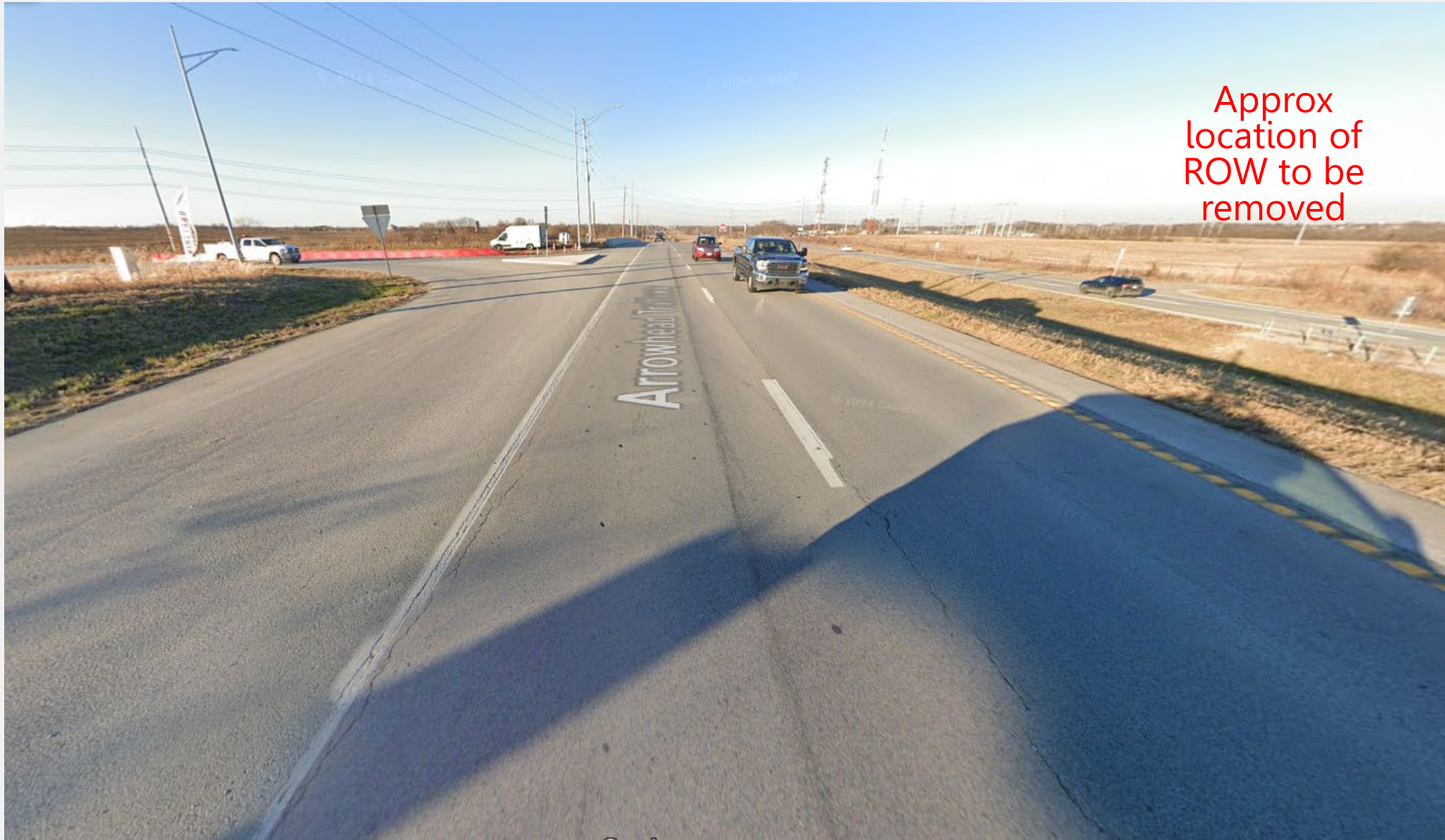
View north. Recently constructed NW 128 th St on the west.