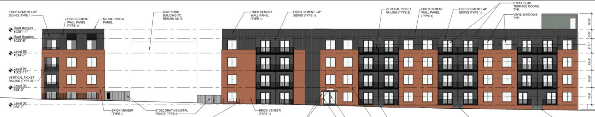
East Elevation (on Bell)