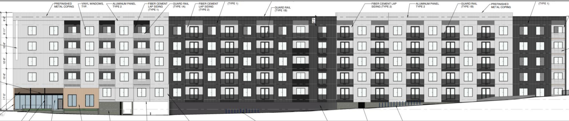
West Elevation (on State Line)