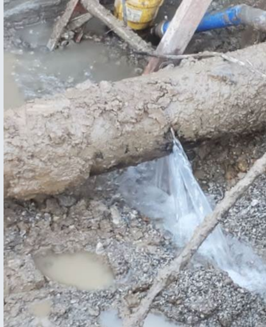
Broken water main leaking