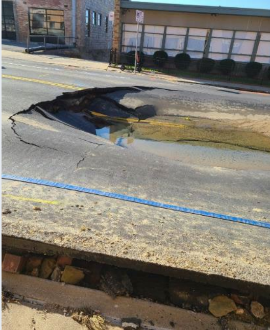
Street collapse due to a water main break