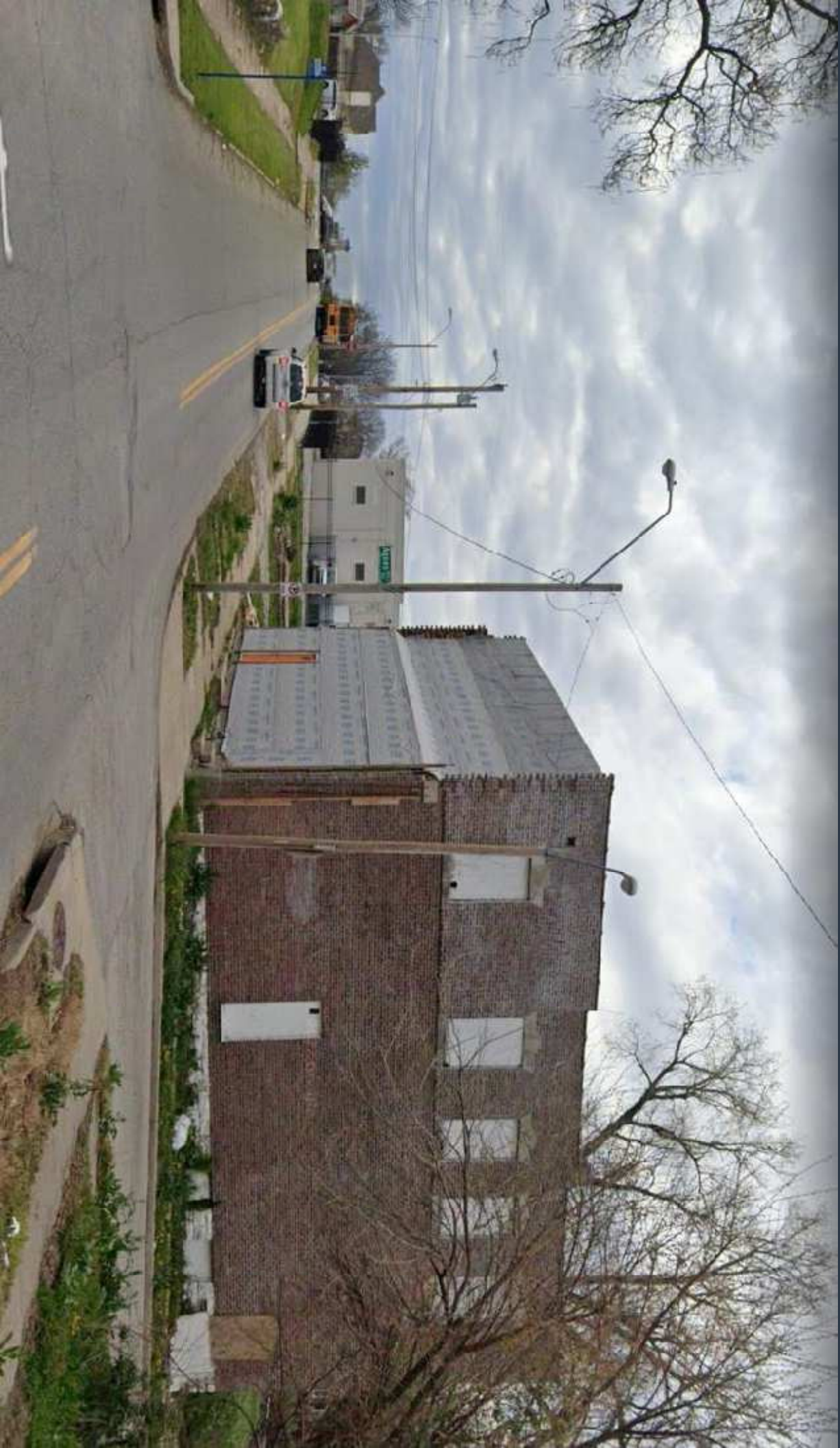
View looking west on E. 23 rd Street