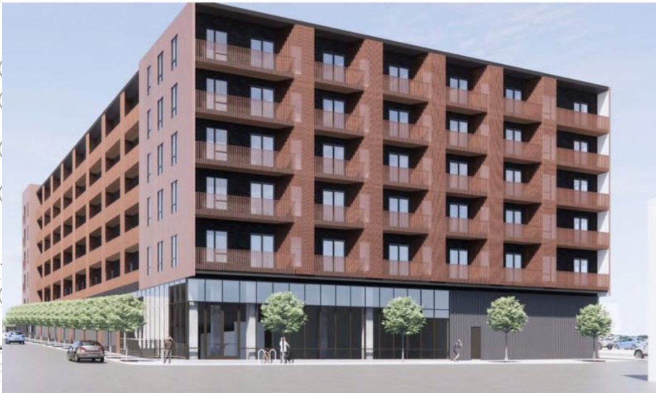
South Elevation (16 th St)