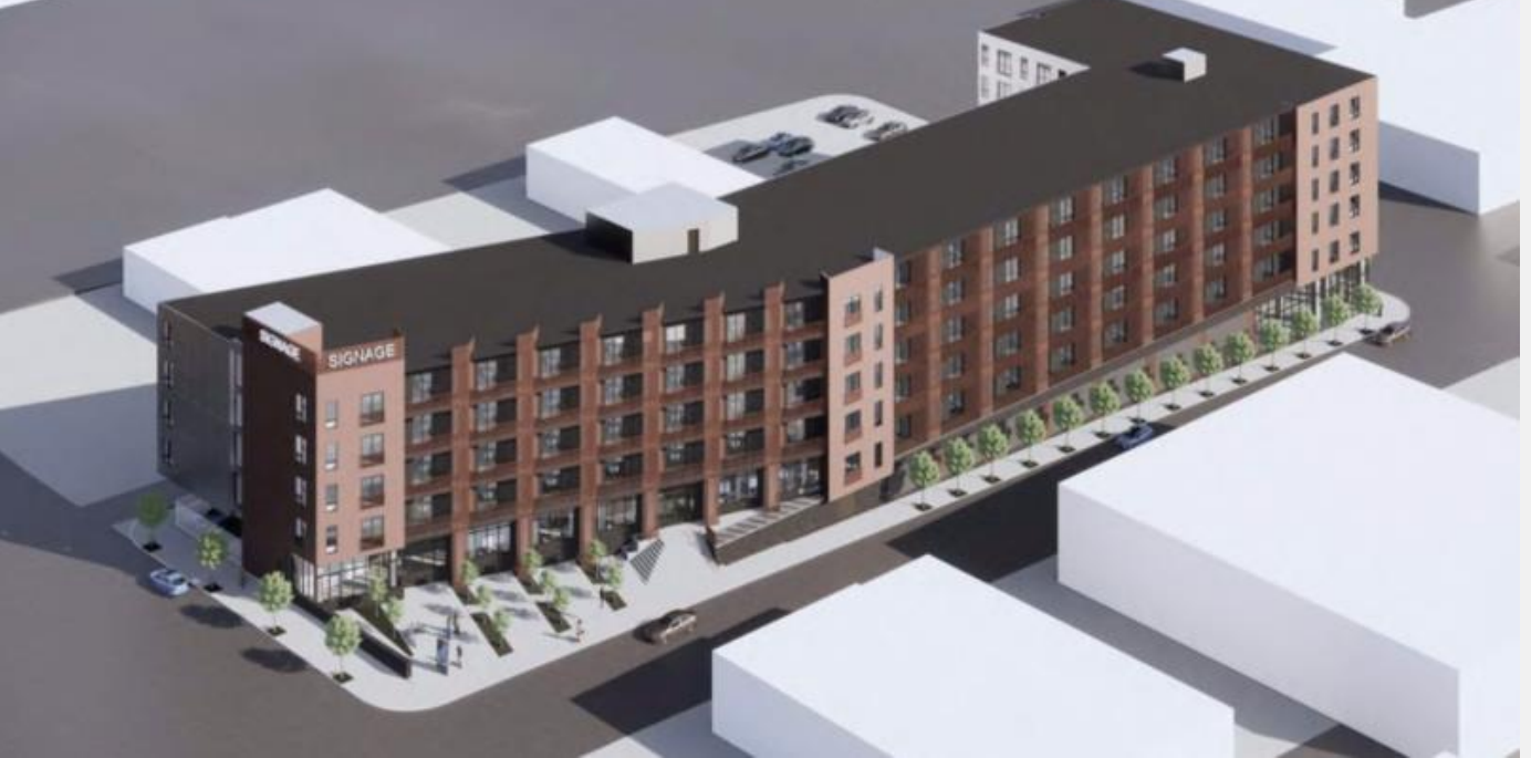
West Elevation – front (Holmes St)