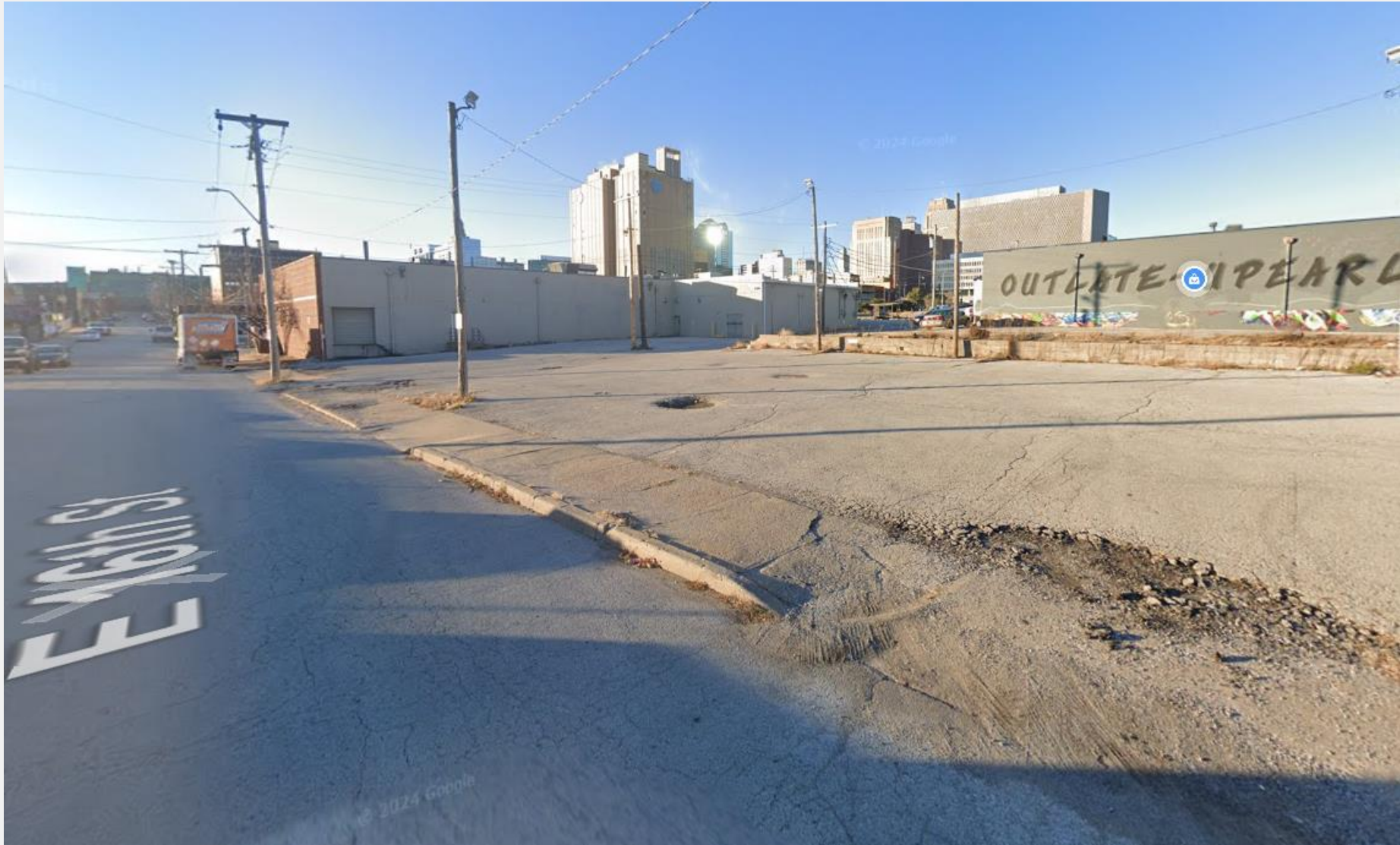
View from 16 th St & Charlotte St towards site. City-owned parking lot to be used and existing alley to access parking garage.