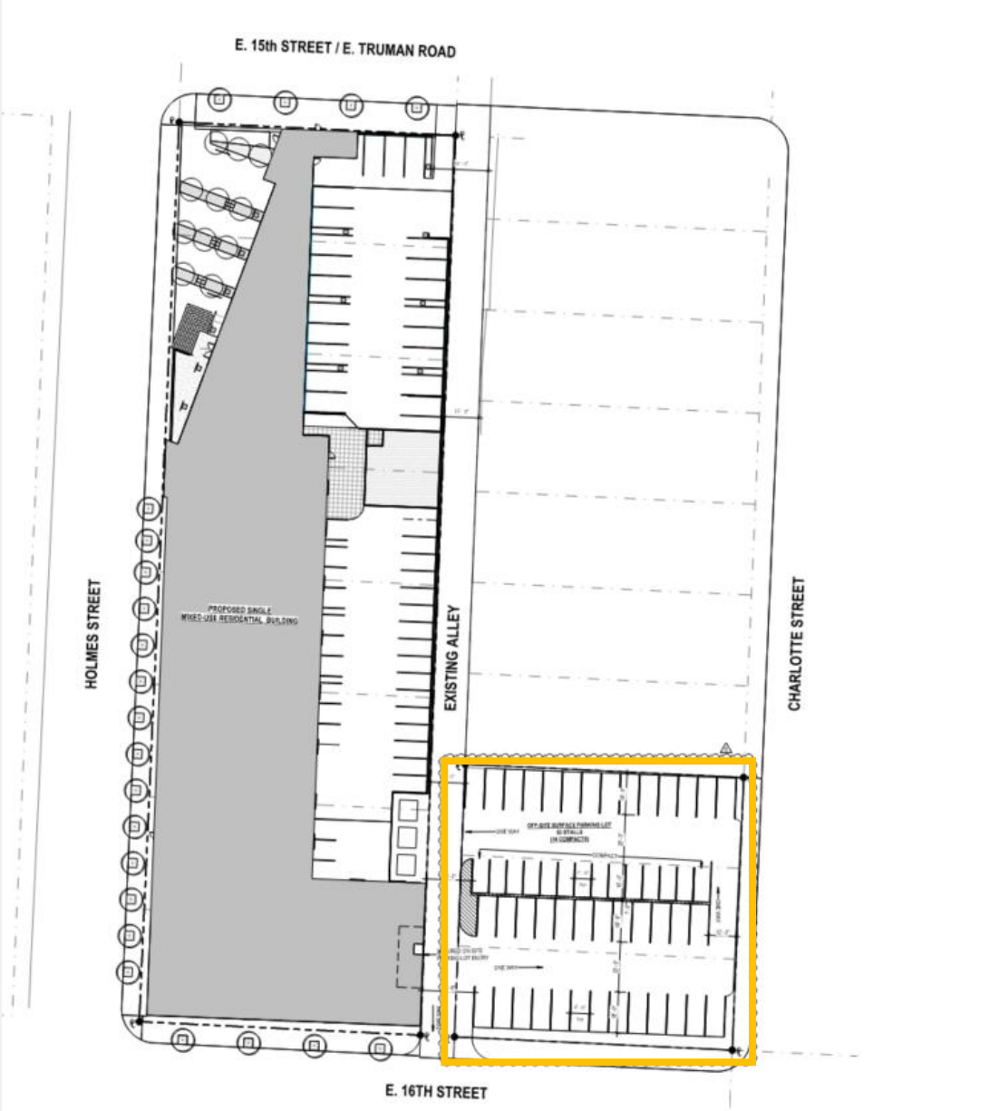
Additional Parking (City-Owned Property)