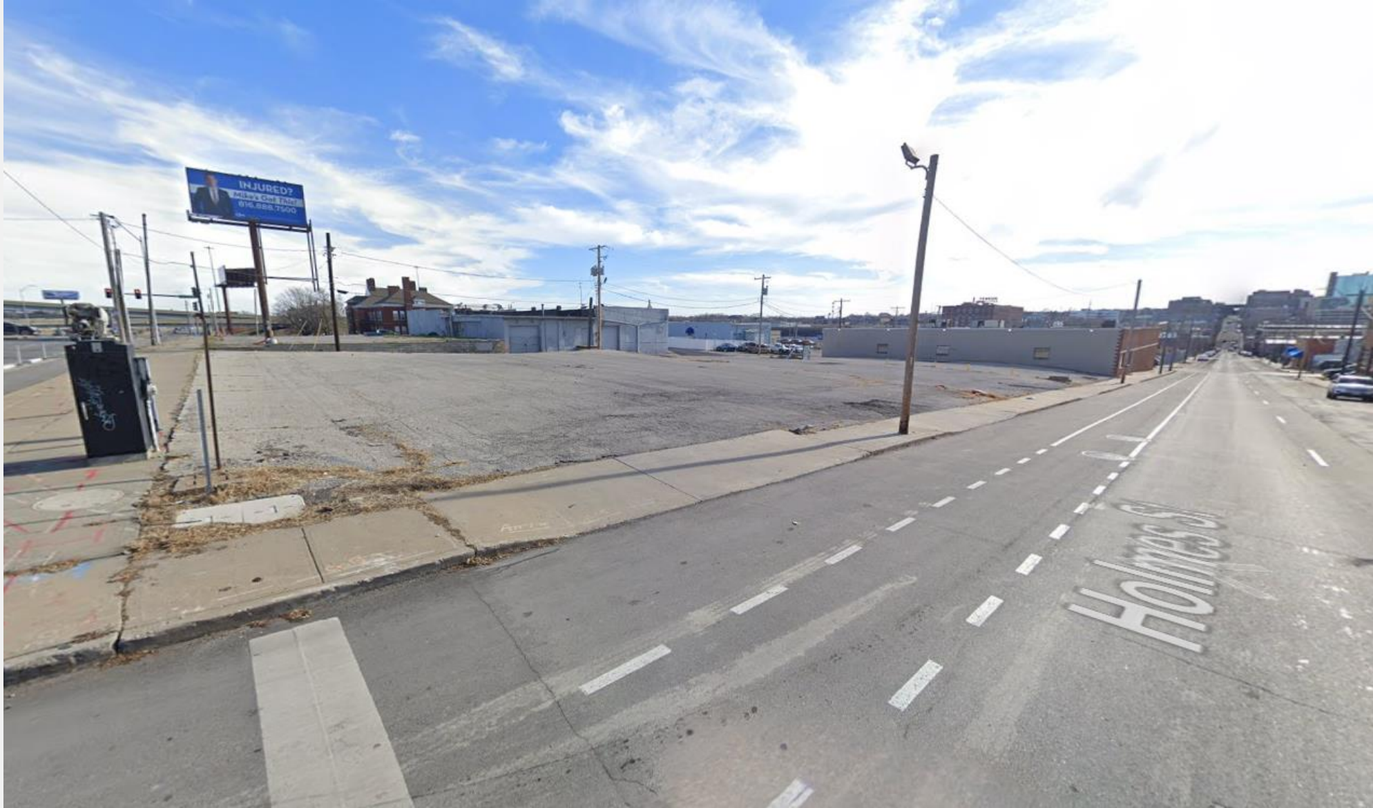
View towards site going south on Holmes St (Dec 2023)