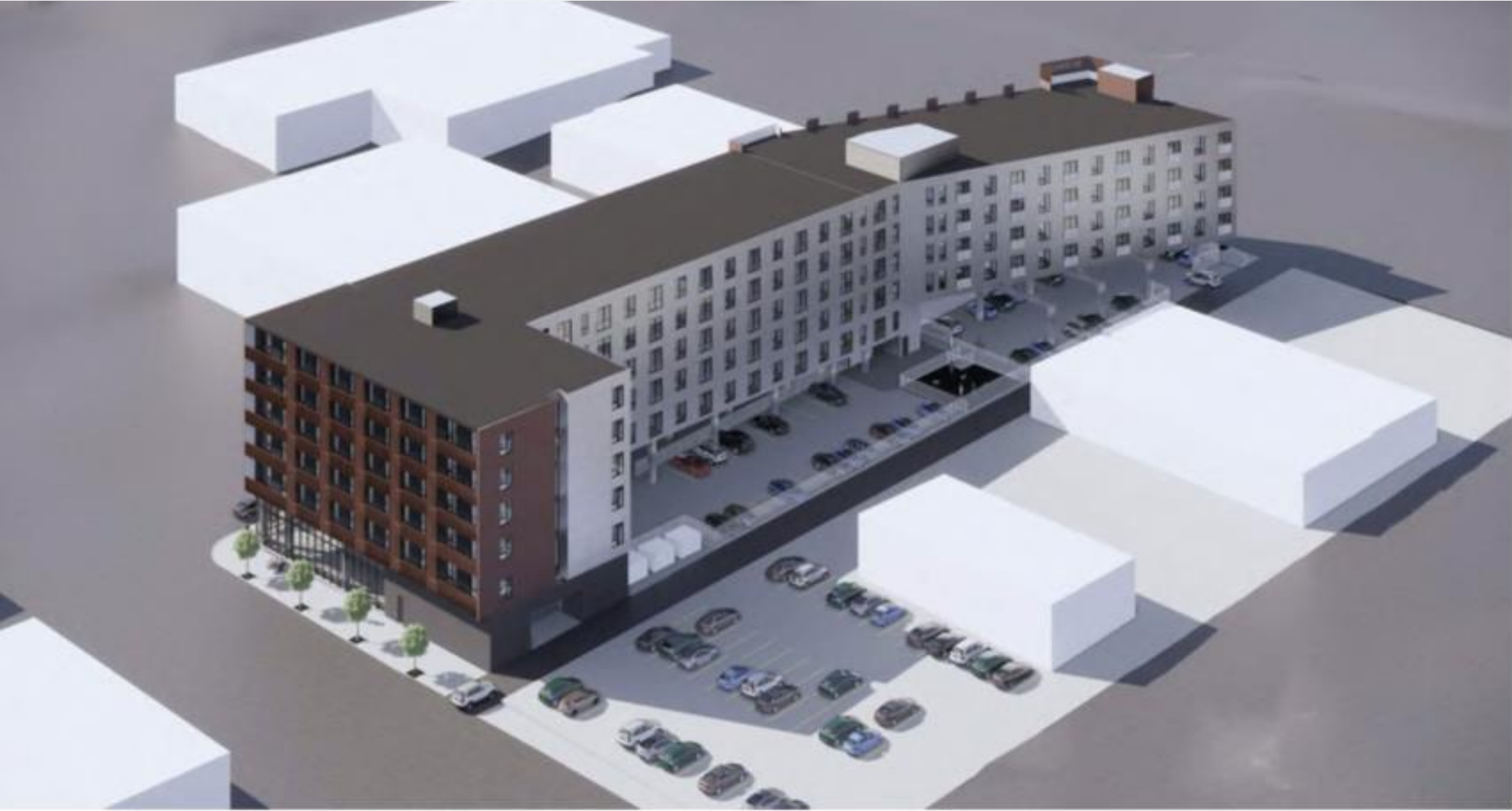
East & South Elevation – (16 th St and Alley)