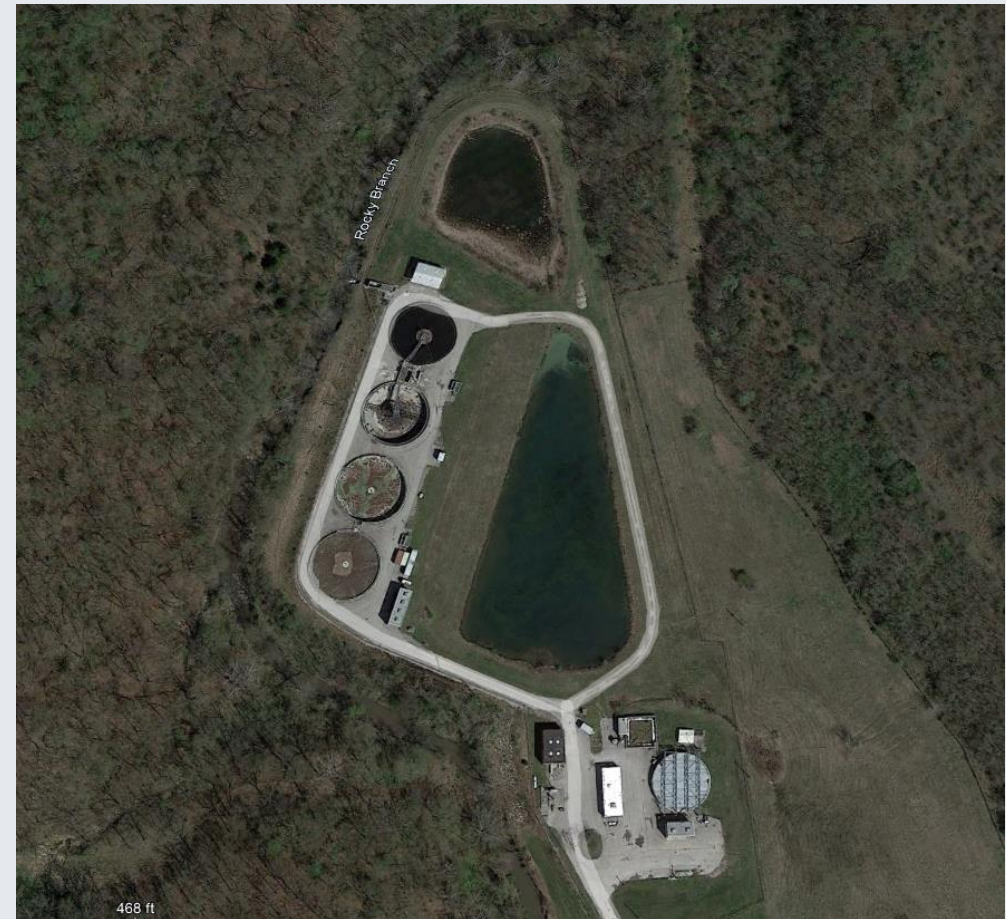
Rocky Branch Wastewater Treatment Plant Areas Served and Site Maps