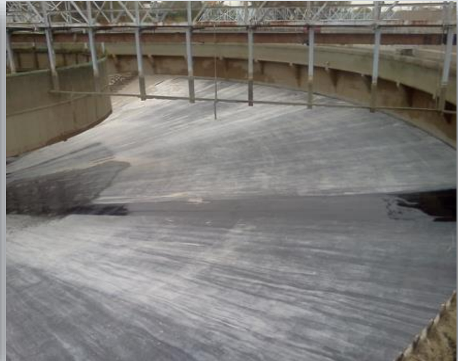
Primary Basins Before and After Cleaning