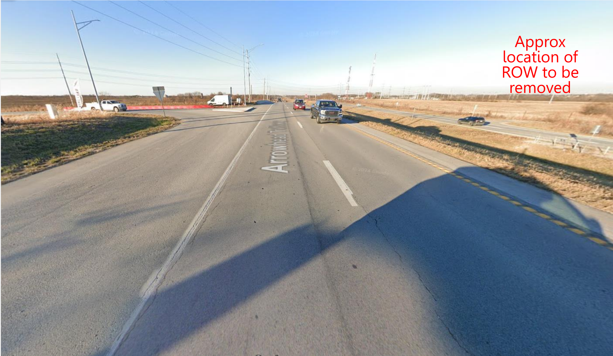
View north. Recently constructed NW 128 th St on the west.