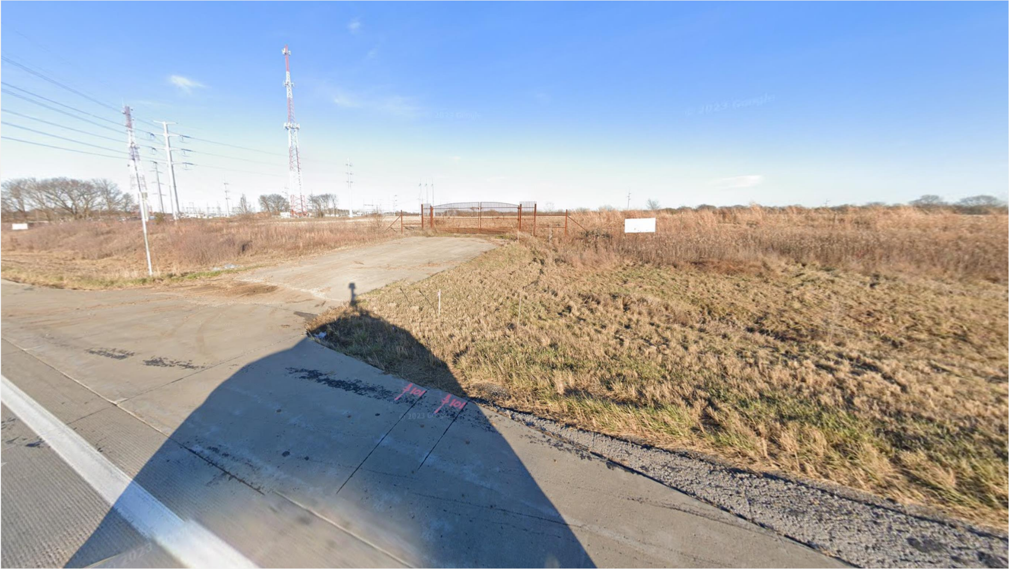
View east towards site from HWY 169 – approximate location of 128 th St