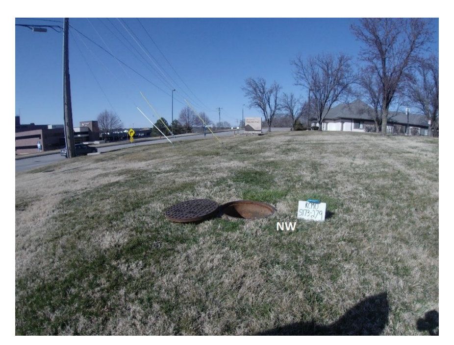
Figure 3.1: Example Area Photo