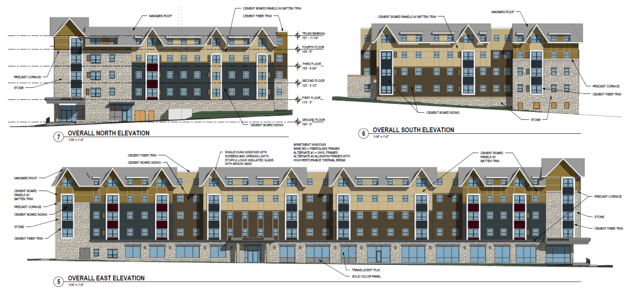
Figure 1 Elevations proposed with original request, plans dated 8/21/12

At the time of City Plan Commission consideration, staff expressed concern with the proposed building elevations in that they are inferior in design to the original proposal. The original proposal included a rhythmic repetition in design and material across each facade and pitched roofs with overhangs. The elevations have not been revised since City Plan Commission, therefore, staff recommends the elevations be revised to be more consistent with the original proposal. See following page for comparison.