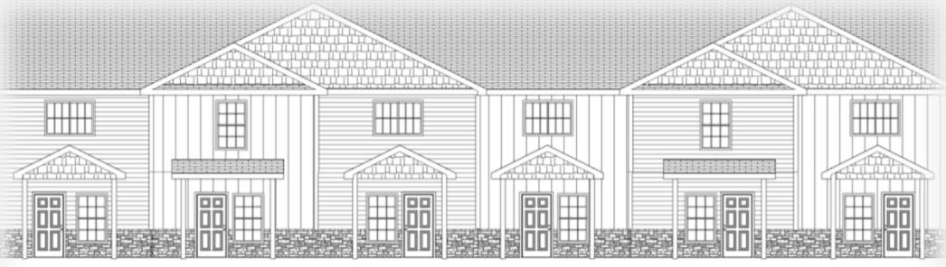
FRONT EL. HARDIE SIDING LAP, B & B, AND SHAKE, ALSO STONE SIDING