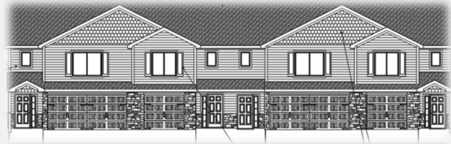
ALL SIDING, SOFFIT AND GUTTERS AND DOWN SPOUTS REQUIRED