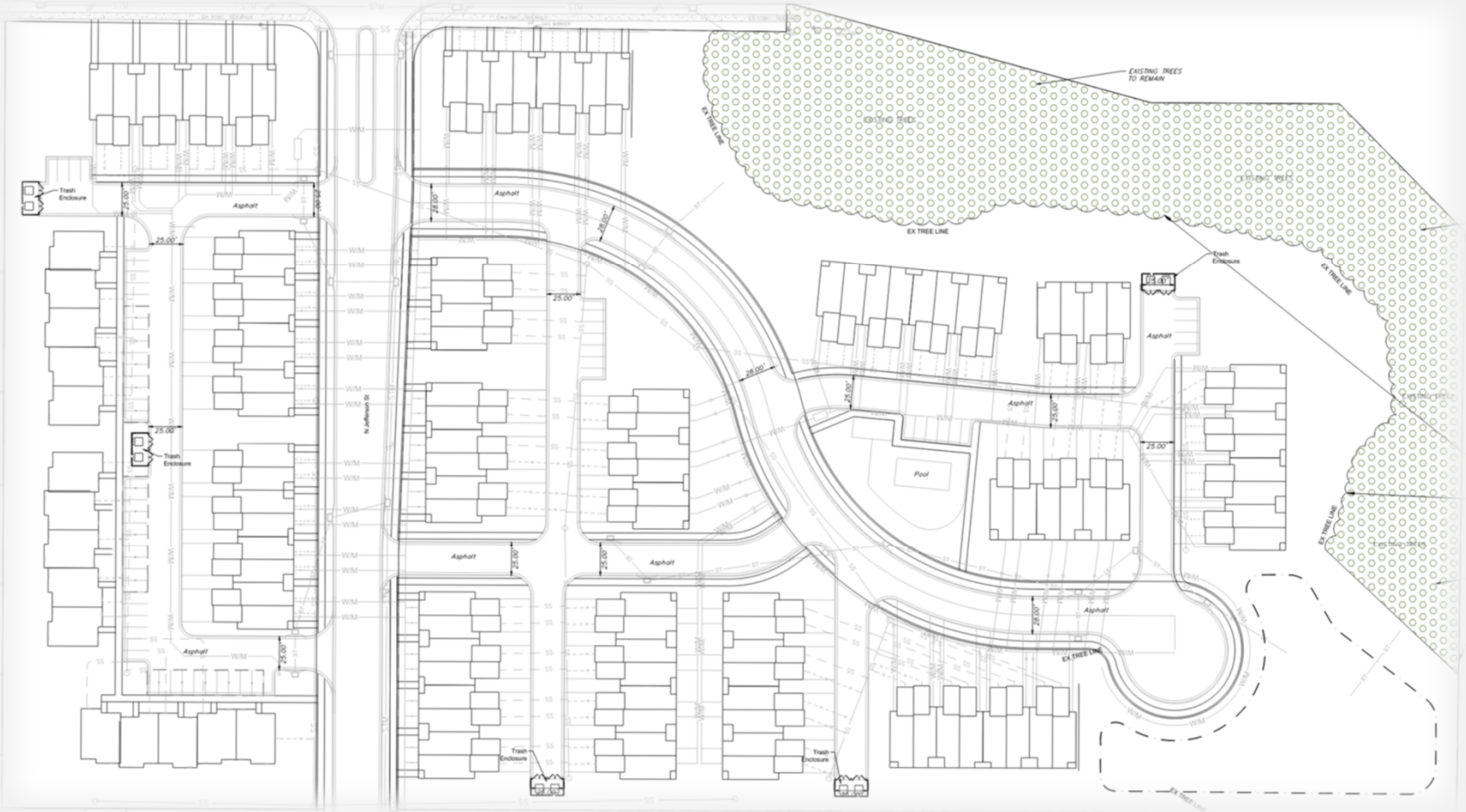
Tree Preservation Plan