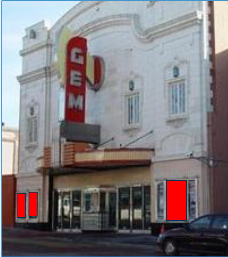
18 th & Vine Custom Screens