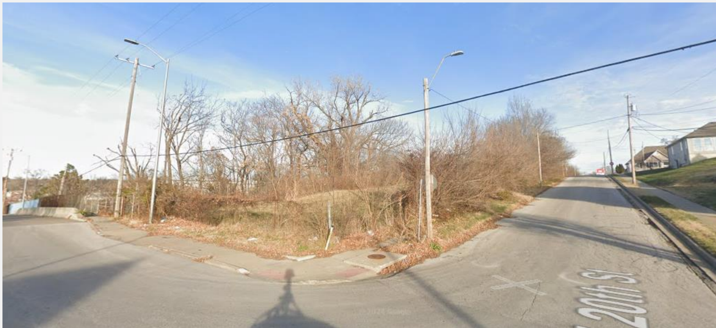
View from East 20 th Street and Brooklyn Avenue