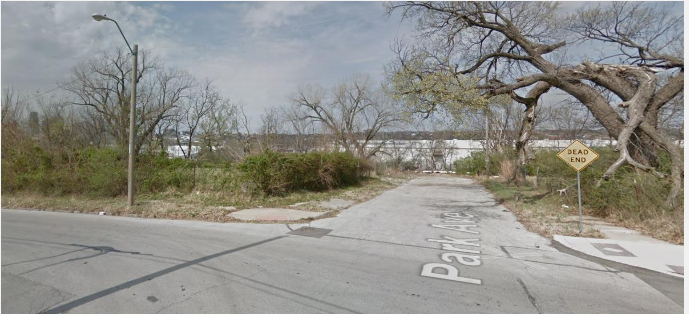
View from East 20 th Street and Park Avenue