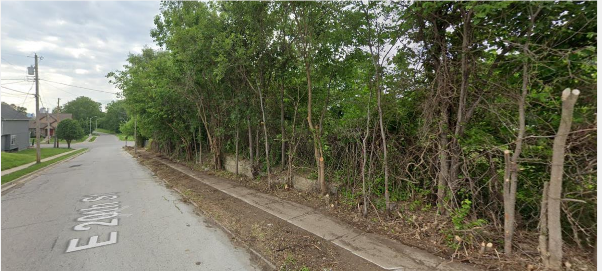
View looking west down East 20 th Street