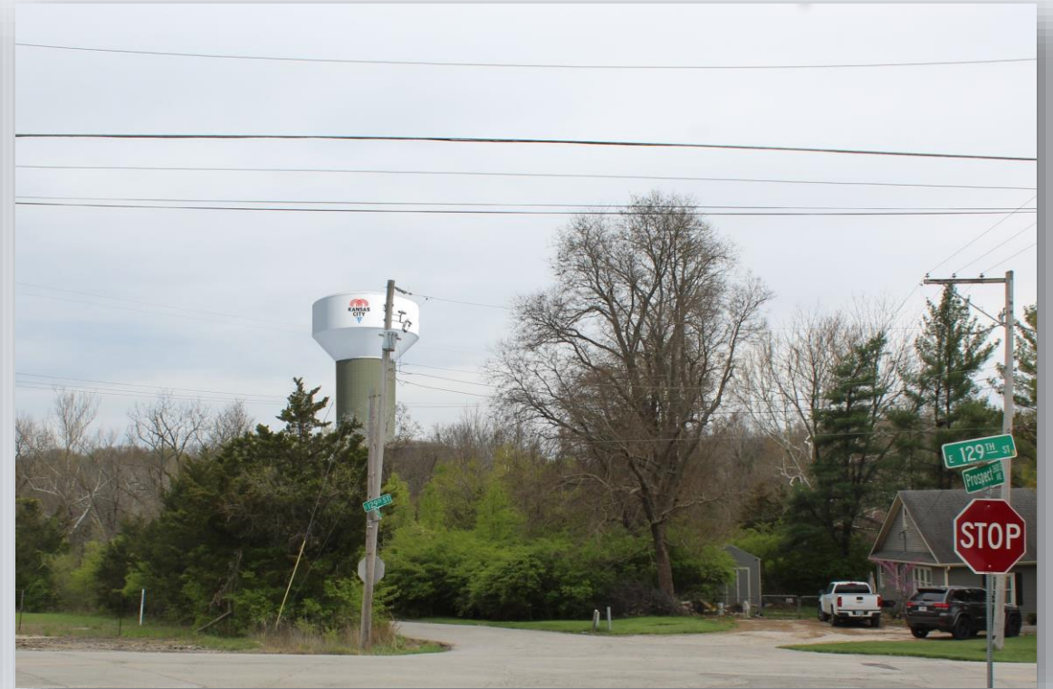
Proposed Prospect Elevated Water Tank views from Robinson Pike Road and 129 th and Prospect in south Kansas City, Missouri