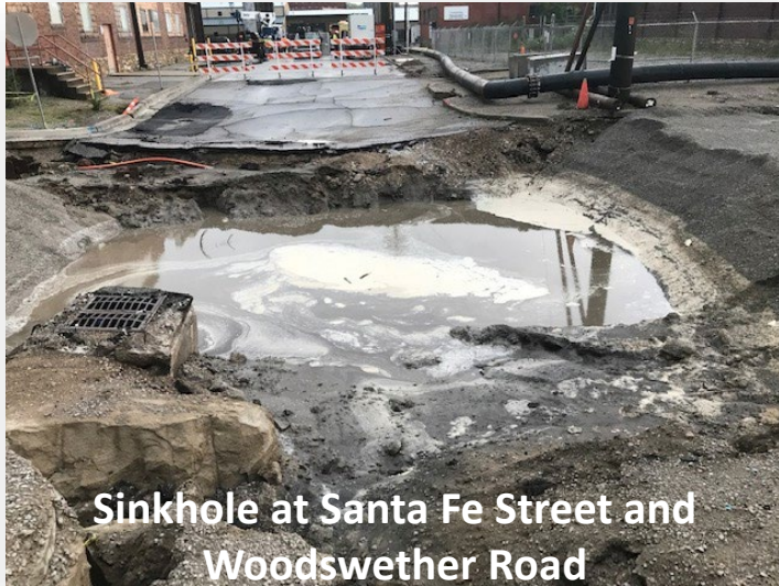
Sinkhole at Santa Fe Street and Woodswether Road