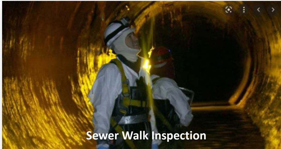
Sewer Walk Inspection