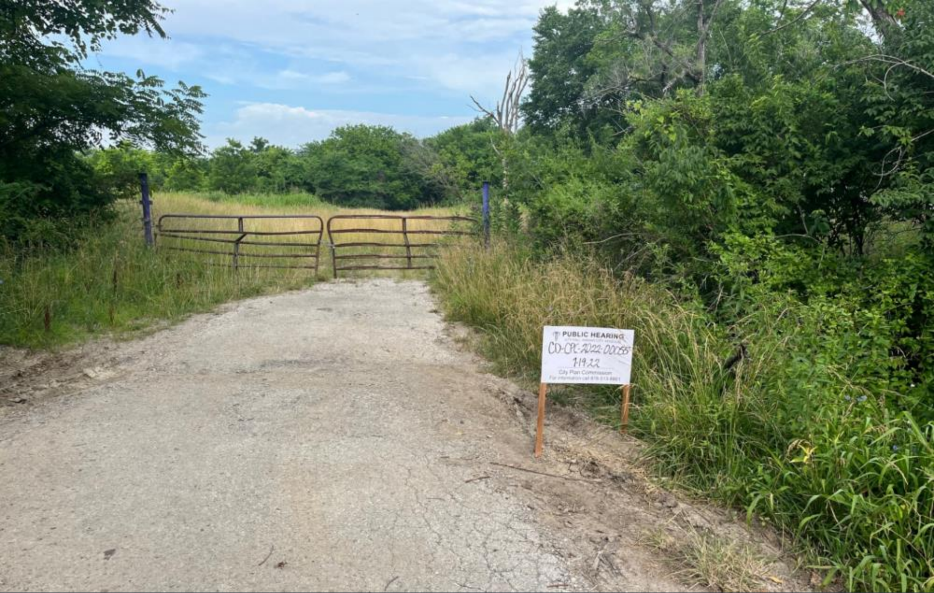
View looking west from E. 52 nd Terrace (June 2022)