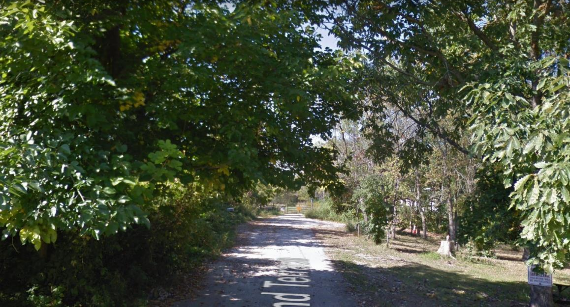
View looking west from E. 52 nd Terrace in 2014