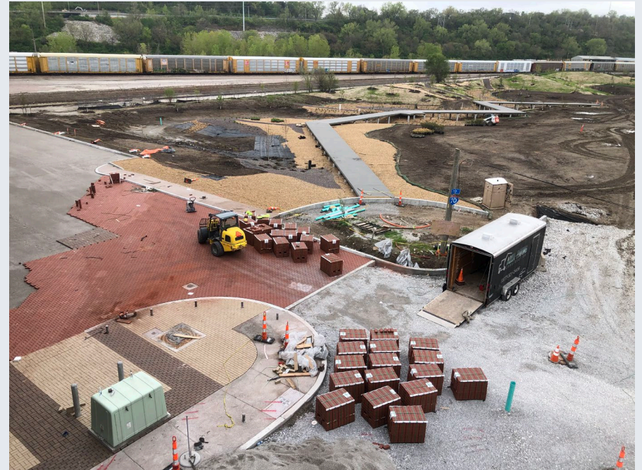
CID West Bottoms Green Infrastructure during construction