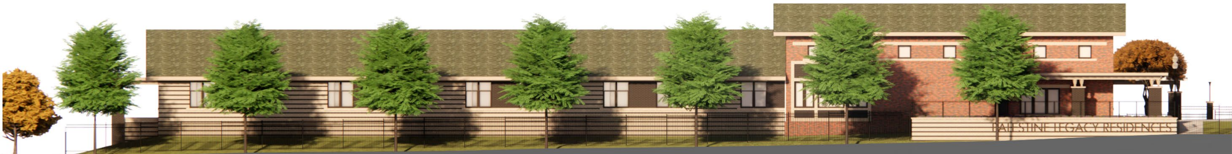
3 MONTGALL AVE. (EAST) ELEVATION SCALE: 1/8" = 1'-0"