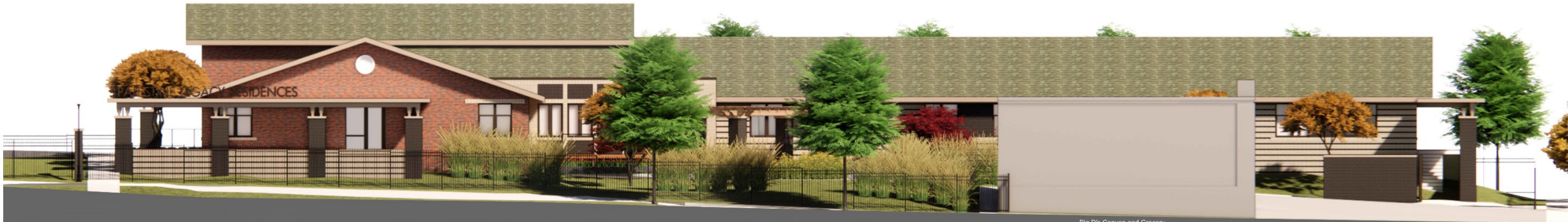
4 PROSPECT AVE. (WEST) ELEVATION SCALE: 1/8" = 1'-0"