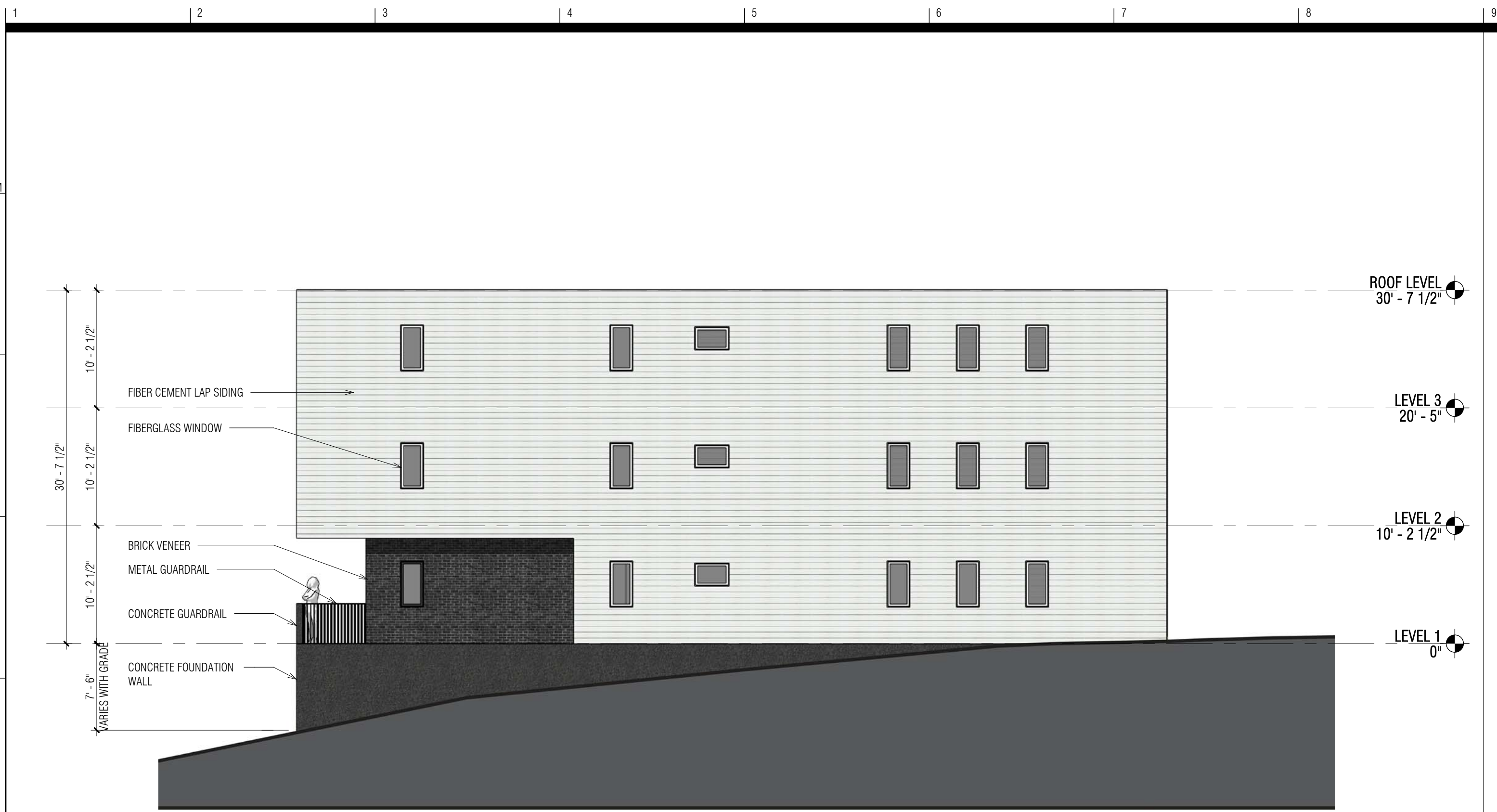
3 Exterior Elevation - South 1/8" = 1'-0" RE: 1/EOcr8.2a