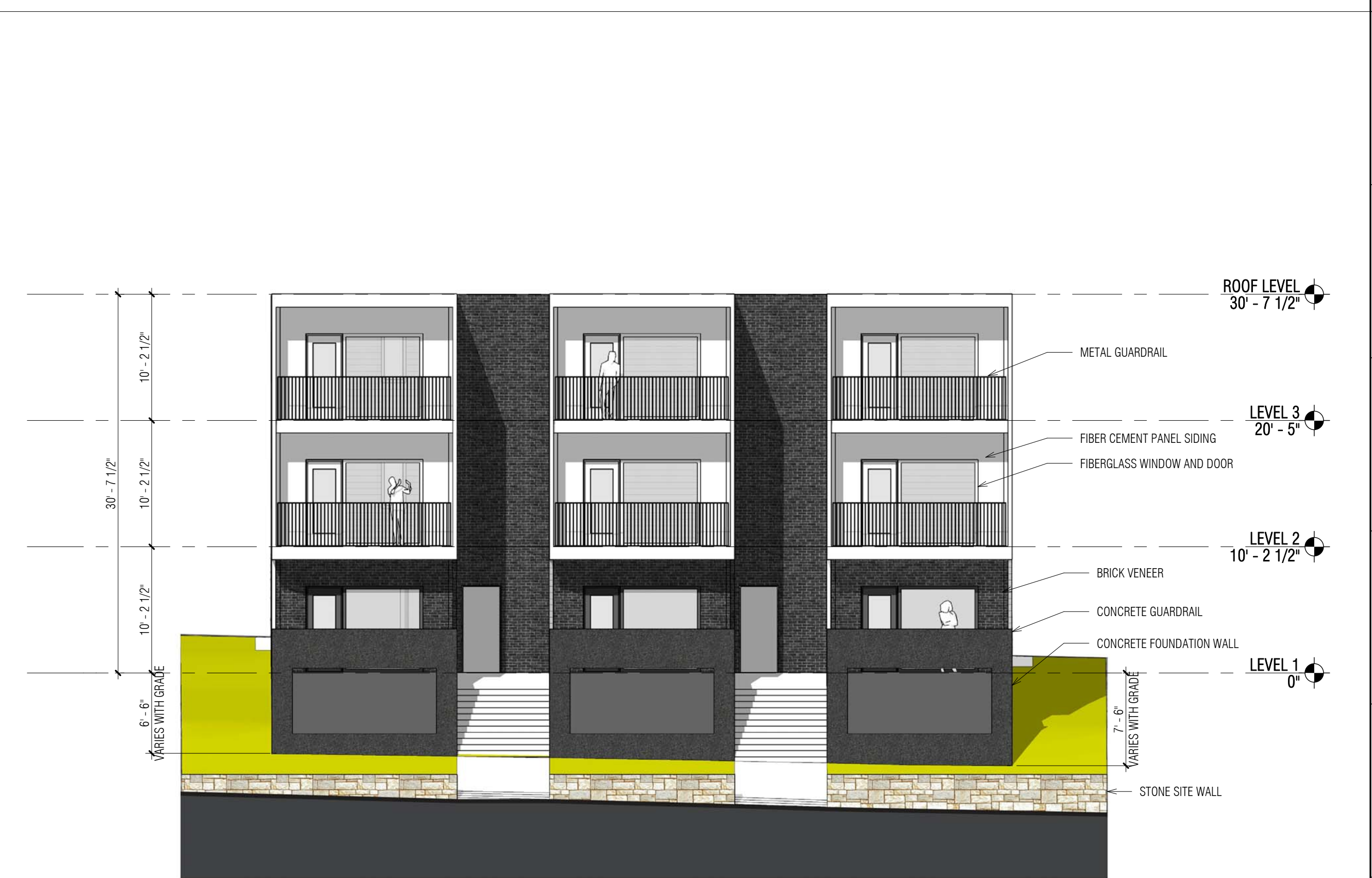
2 Exterior Elevation - West 1/8" = 1'-0" RE: 1/EOcr8.2a