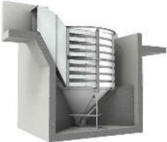
NEW GRIT HEADCELL - EAST END