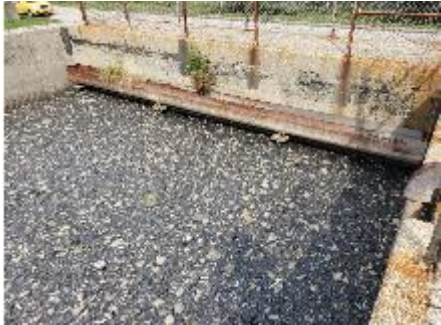
EXISTING GRIT CHAMBER #1 - EAST END