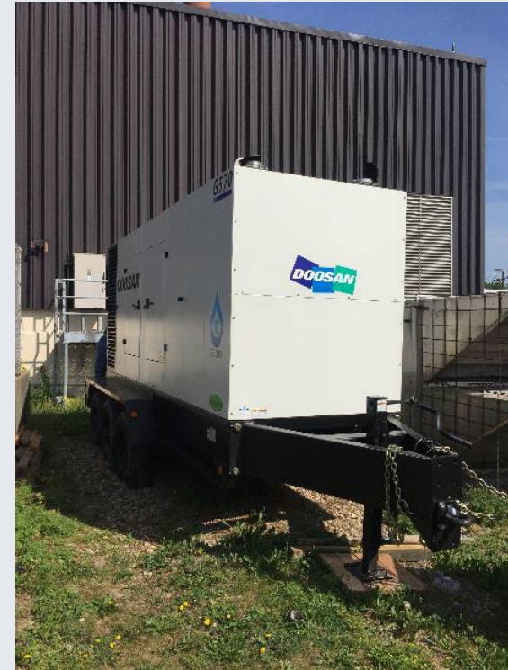
Wastewater Backup Generator Location Map and Example