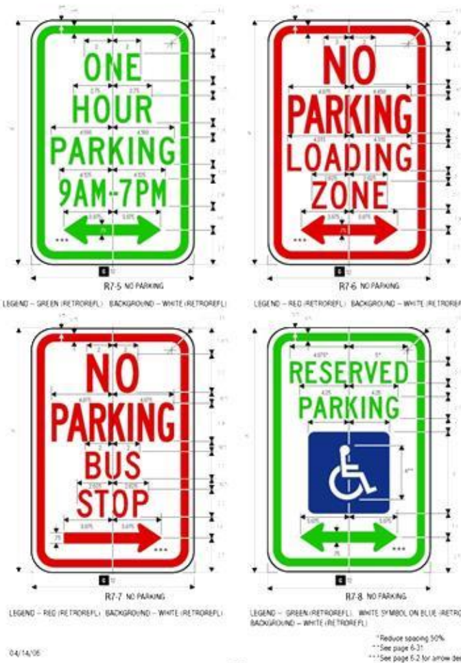
R7-5 NO PARKING LEGEND - GREEN (RETROREFL) BACKGROUND - WHITE (RETROREFL) R7-6 NO PARKING LEGEND - RED (RETROREFL) BACKGROUND - WHITE (RETROREFL) R7-7 NO PARKING LEGEND - RED (RETROREFL) BACKGROUND - WHITE (RETROREFL) R7-8 NO PARKING LEGEND - GREEN (RETROREFL) WHITE SYMBOL ON BLUE (RETROREFL) BACKGROUND - WHITE (RETROREFL)