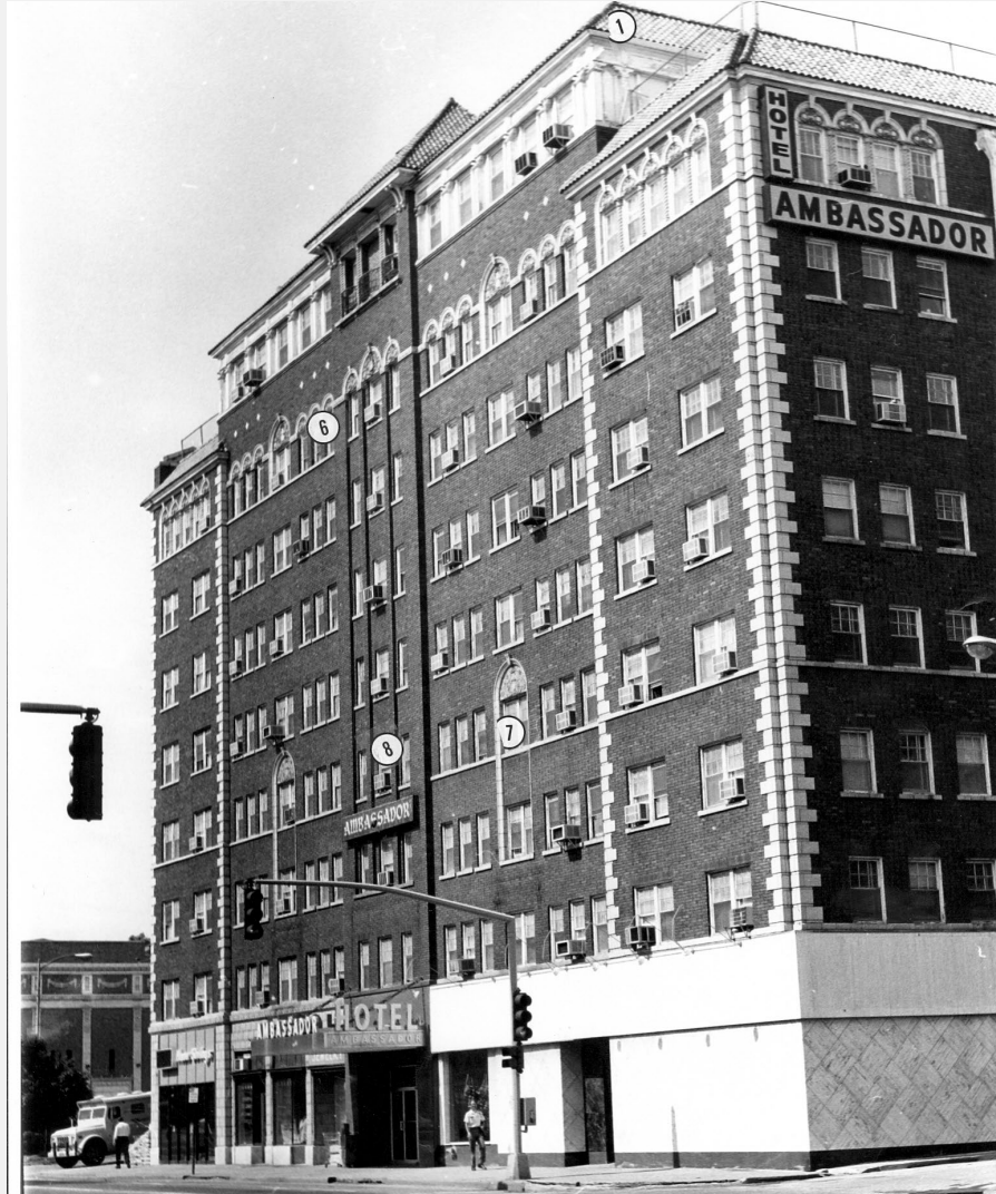
Ambassador Hotel Designated 1982