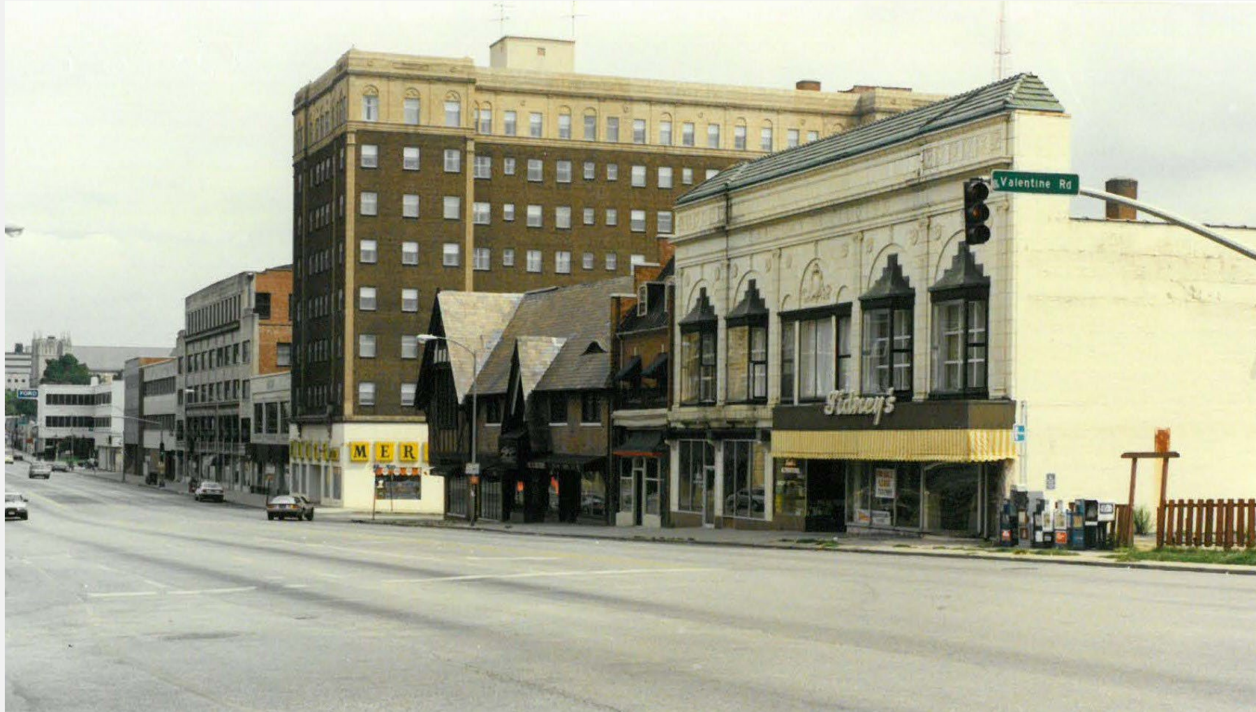
Ambassador Expansion 1988