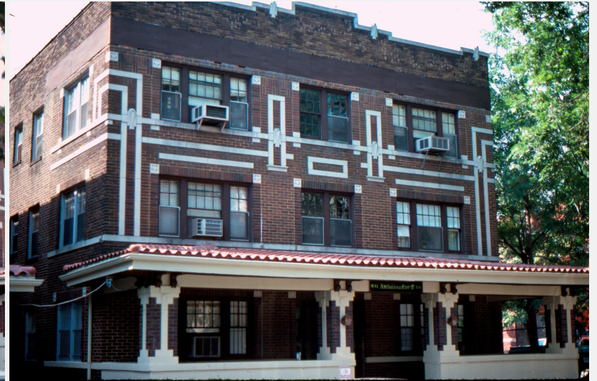
Little Ambassadors 435 and 441 Knickerbocker Place Designated 1982 Demolished in 2012