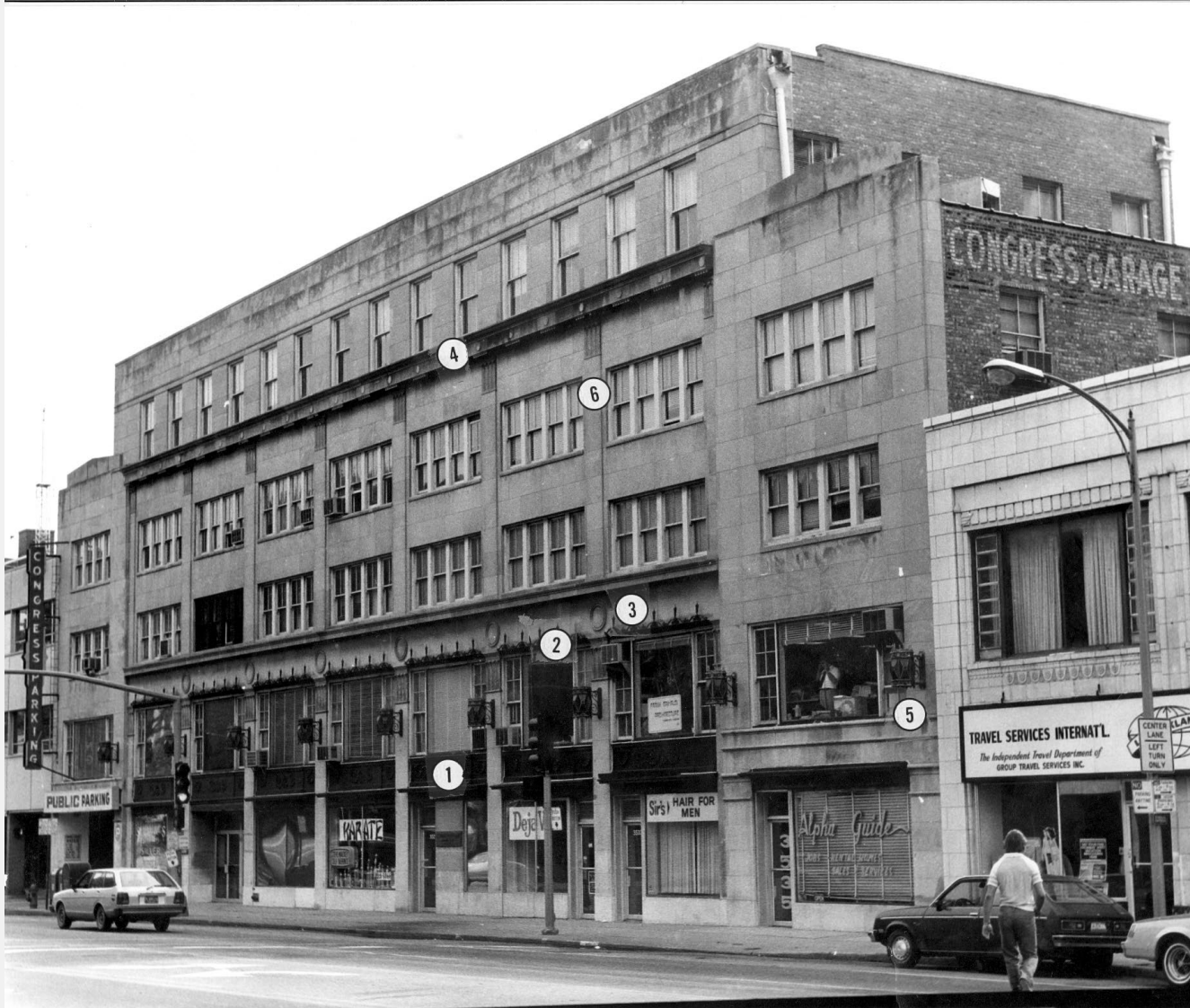
Congress Building Designated 1982