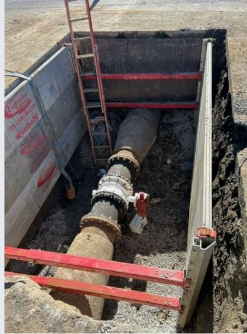
Replacement of a Ball Valve with a Butterfly Valve