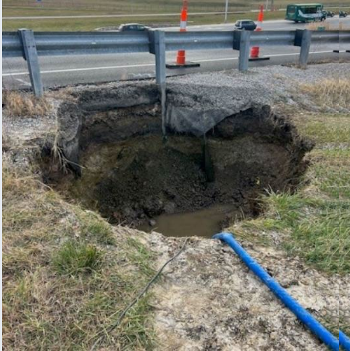
Water Main Break Aftermath