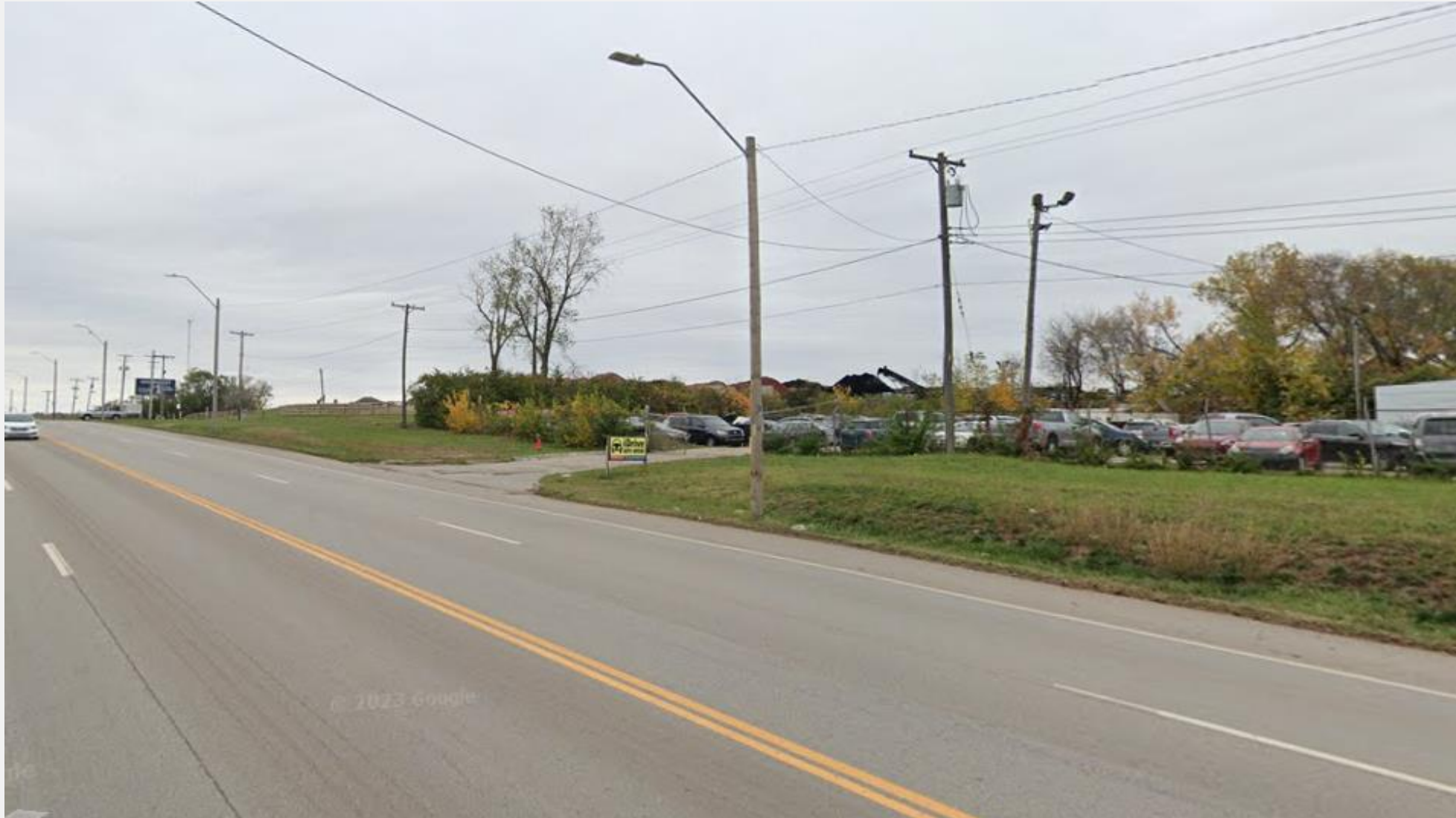
View looking West on Highway 40