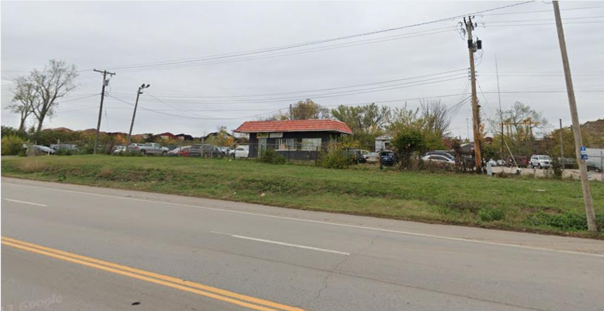
View of the site as of October 2023