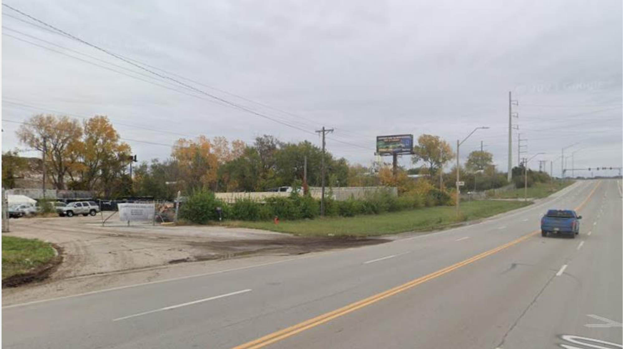
View looking east from Highway 40