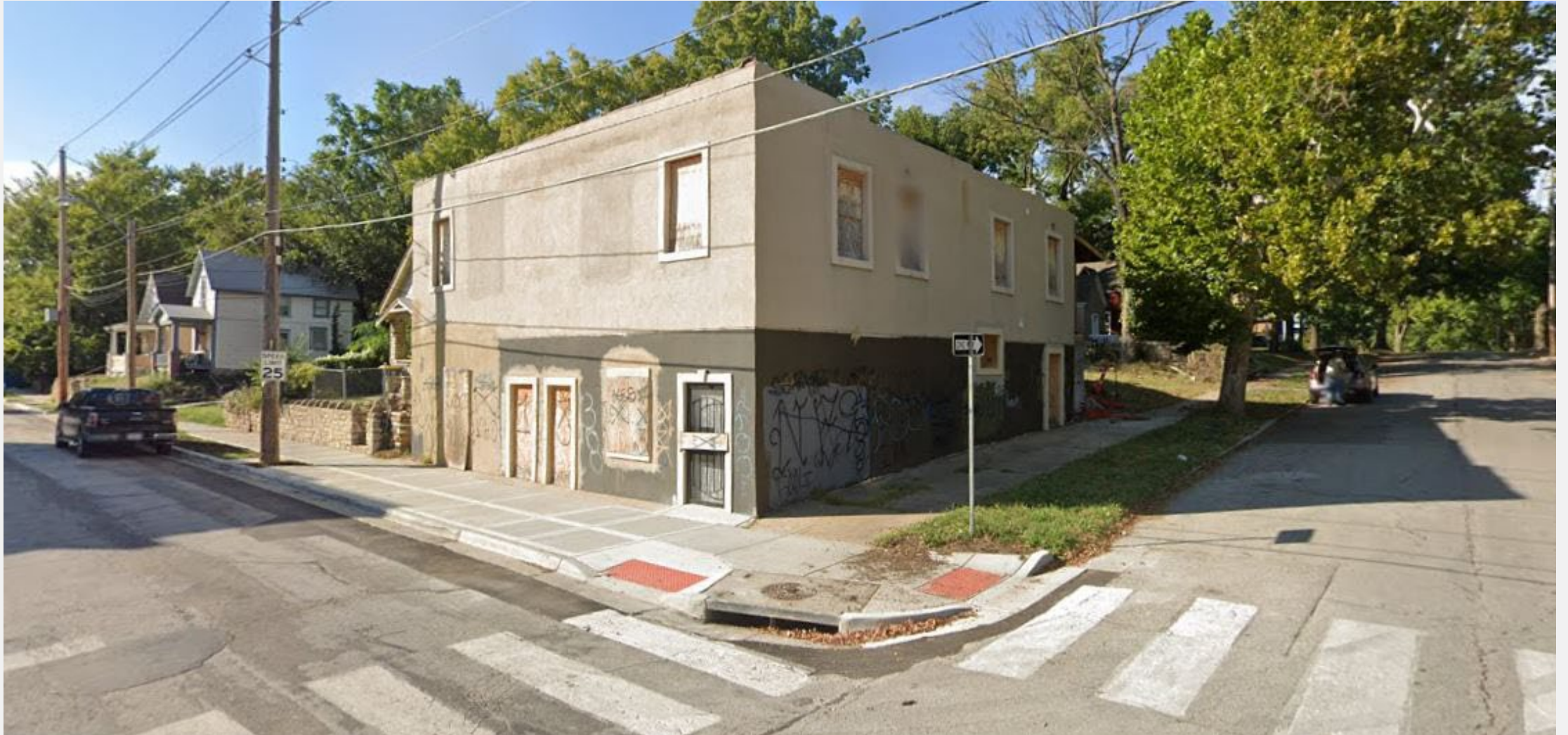
Corner of N Topping and Scarritt Avenue