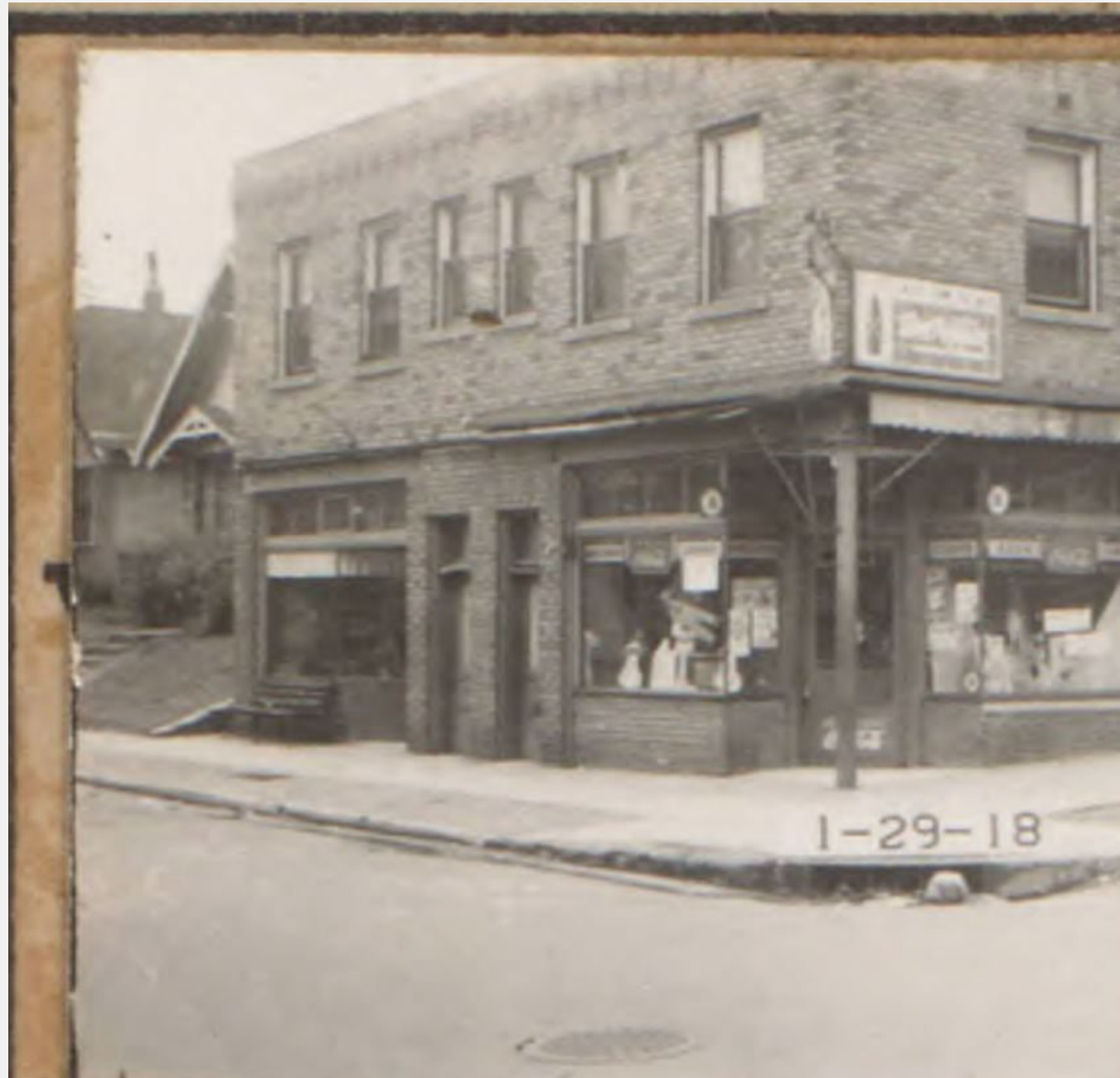
Sanborn Picture of the Property