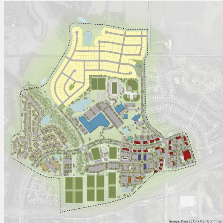
Twin Creeks: Zoned MPD