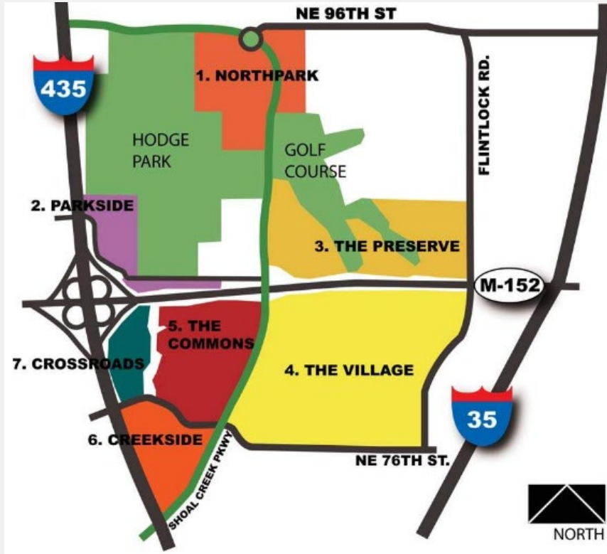
Shoal Creek: Zoned SC