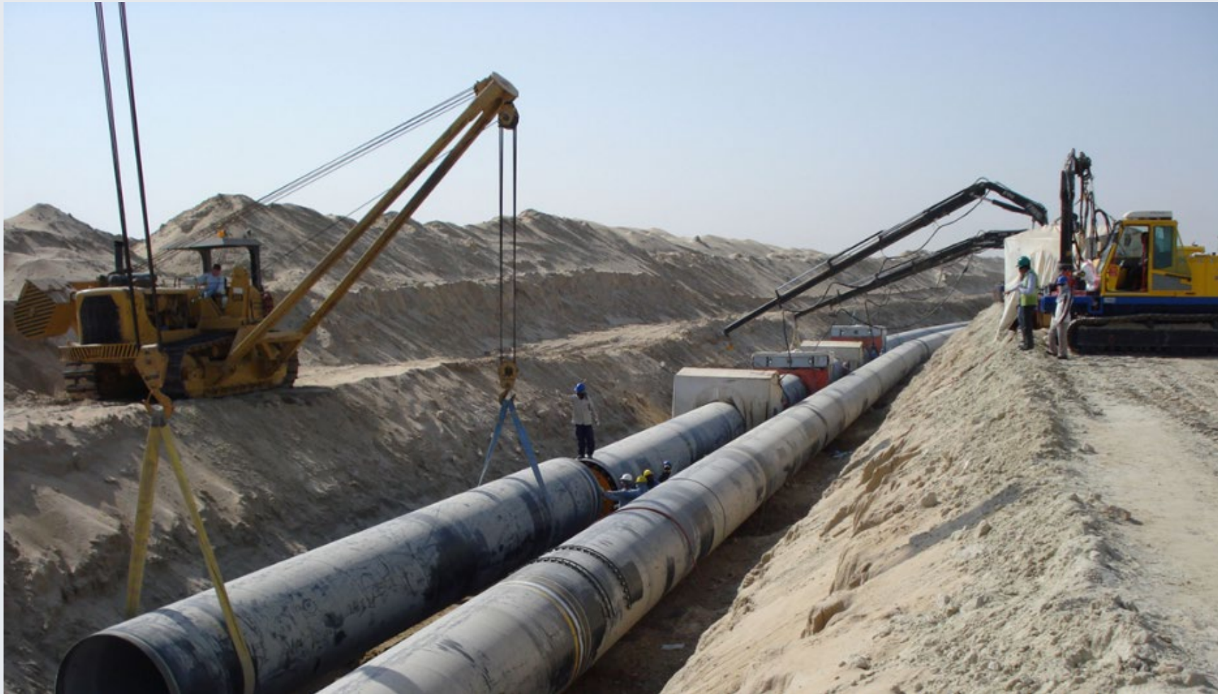
Water Transmission Pipes