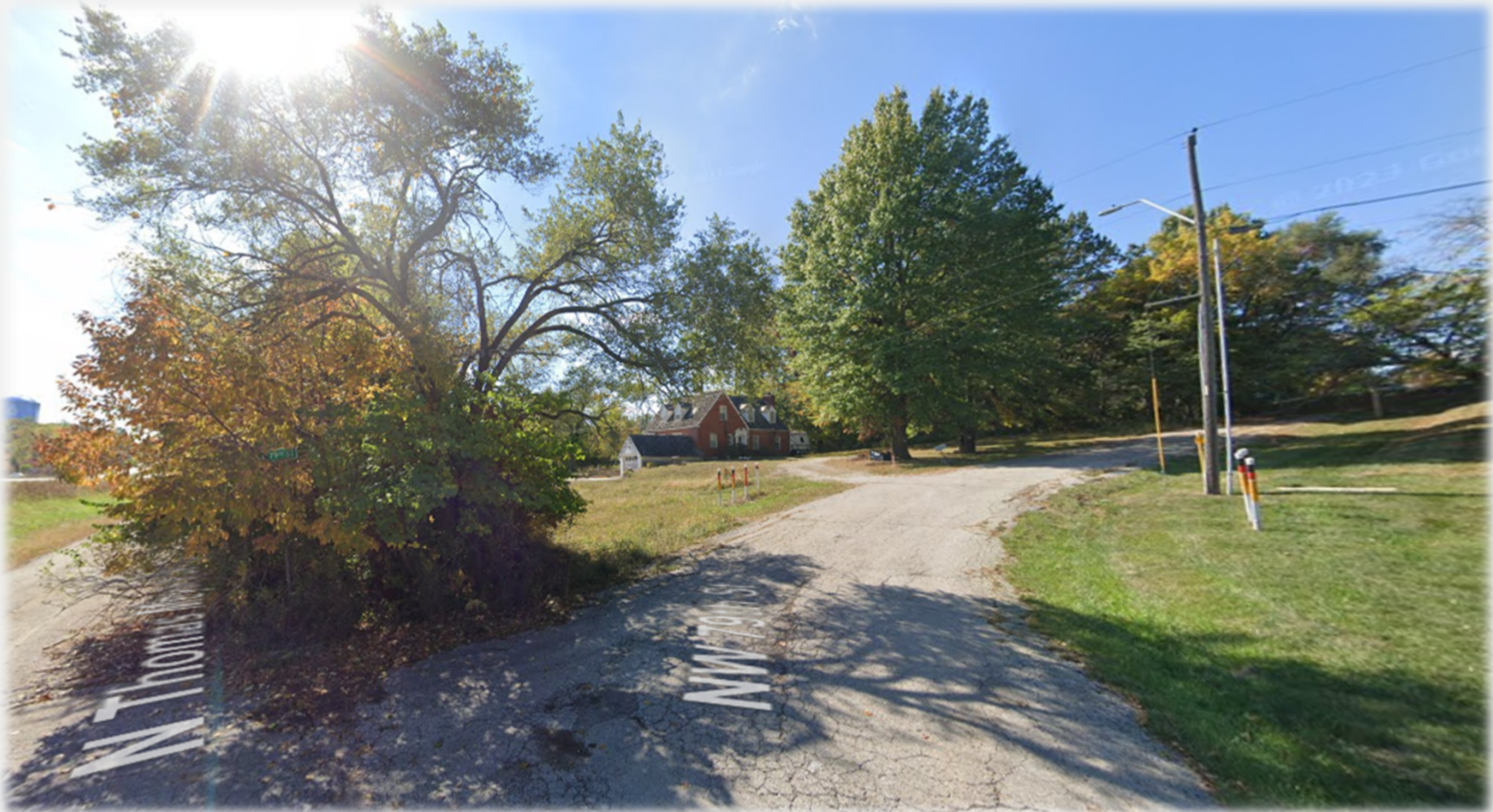
View looking southwest from NW 79 th Street