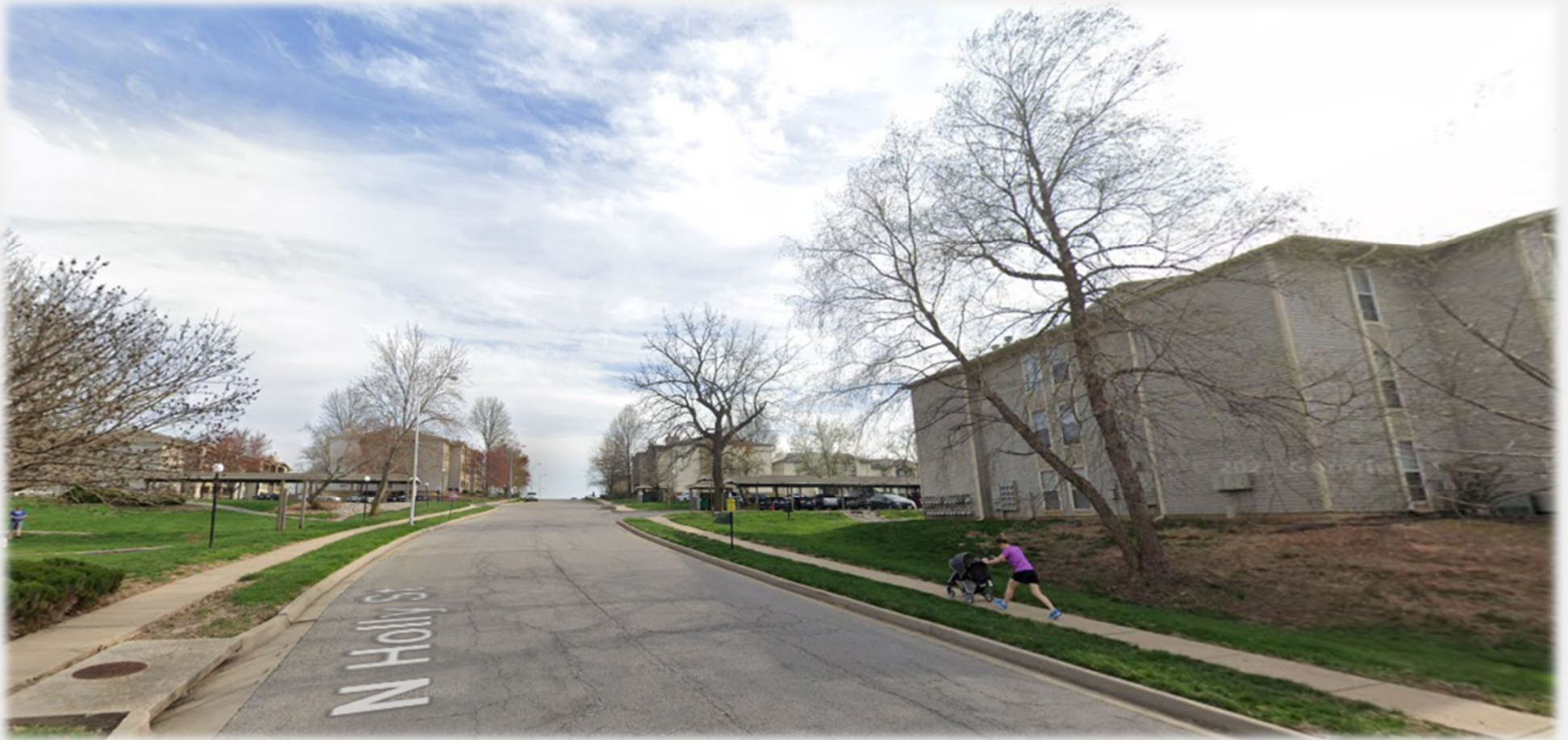
View of existing apartments directly west of subject property