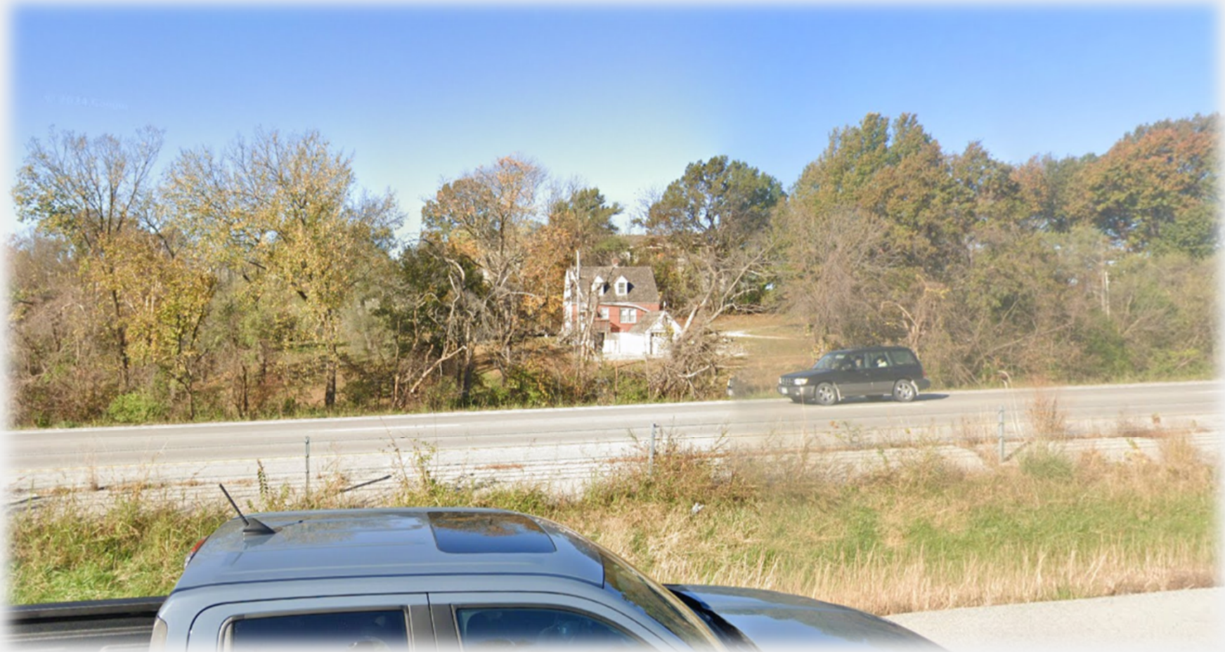
View looking west from US Route 169