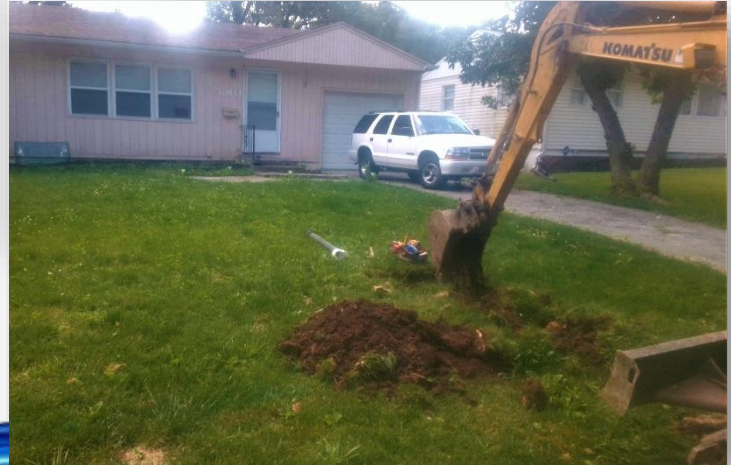
Automated Metering Equipment and Installation