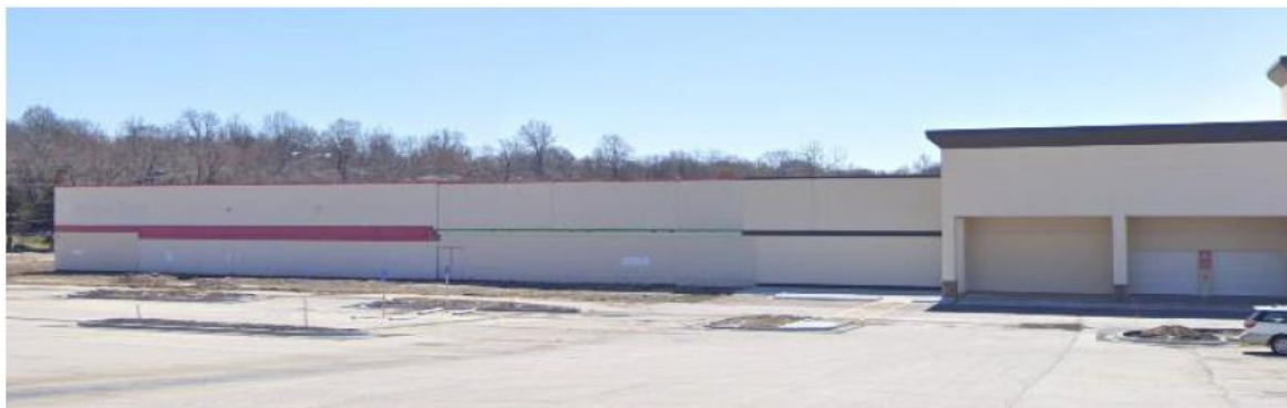
Former Kmart Shopping Center Part of 5601 Bannister Rd and 5619 Bannister Rd Kansas City, MO 64137