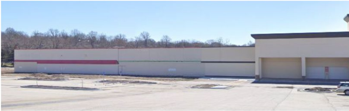
Former Kmart Shopping Center Part of 5601 Bannister Rd and 5619 Bannister Rd Kansas City, MO 64137