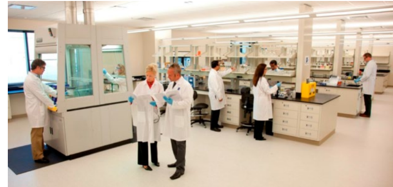
Typical Modern Lab