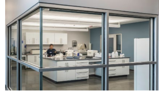
Typical Modern Lab