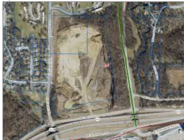
Existing site aerial (approx. 2018)

The site is currently undeveloped, but has been hope to a soil and ground cover excavation site. The approximately 37-acre site is bounded by N Brighton Ave on the west, M-210 Hwy. on the south, NE Searcy Creek Pkwy on the east, and NE 36th St). Primary access to the site is provided by N Brighton Avenue, which is an unimproved two-lane road with an open drainage channel adjacent to this property. A section of N Brighton Ave is partially improved and under the jurisdiction of the MoDOT near its interchange with M-210 Hwy. M-210 Hwy is a freeway with a partially improved one-way westbound frontage road immediately south of the site.