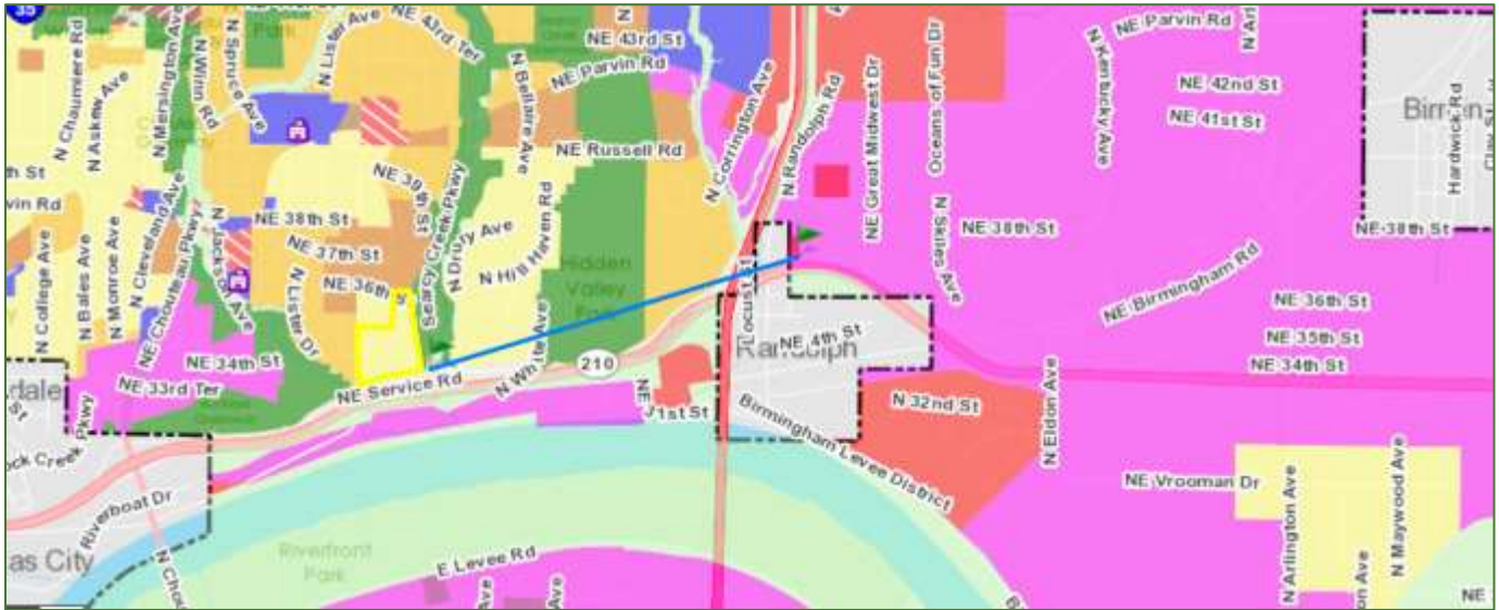
Except from the Briarcliff-Winnwood Area Plan

It should also be noted there is an abundance of "Light Industrial" recommended land use acreage approximately one mile to the east of the site along M-210 Hwy.