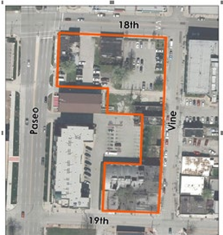
RFP Project Area