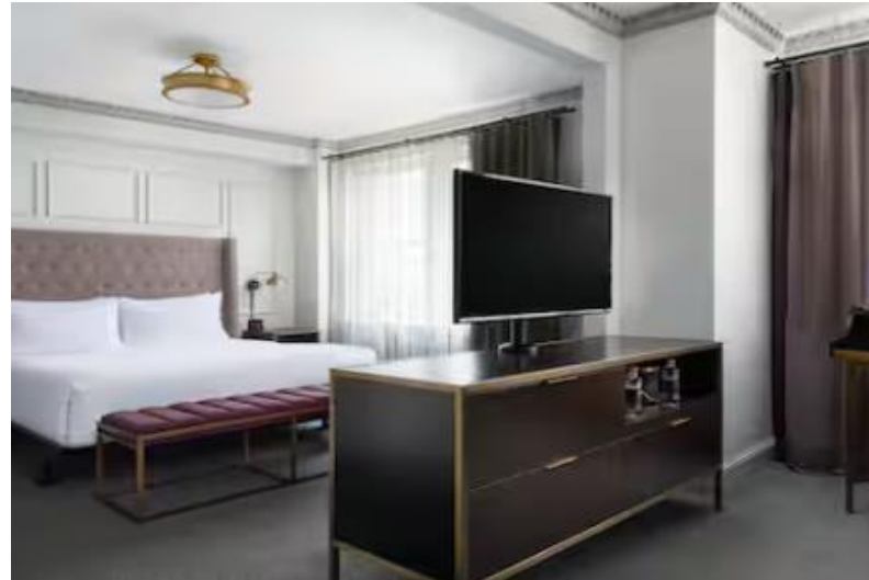
Project A – Hotel Phillips 109 W 12 th St