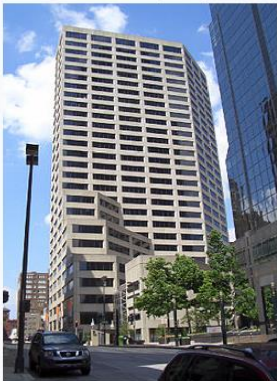
Project C - 1100 Main