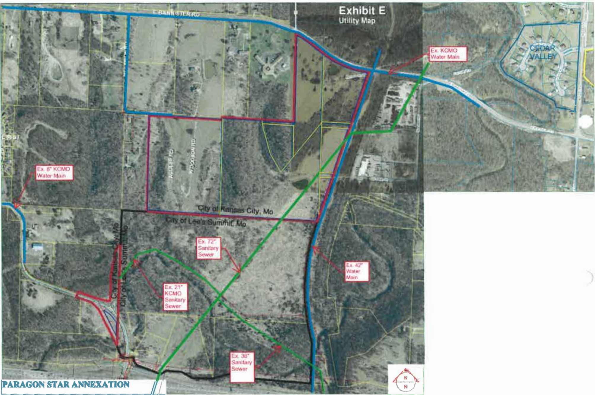
Exhibit E Utility Map