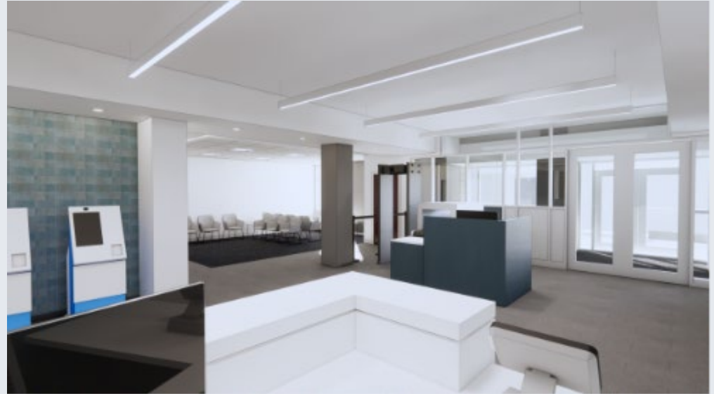
Before/After View Looking South From Reception/Check-In Desk