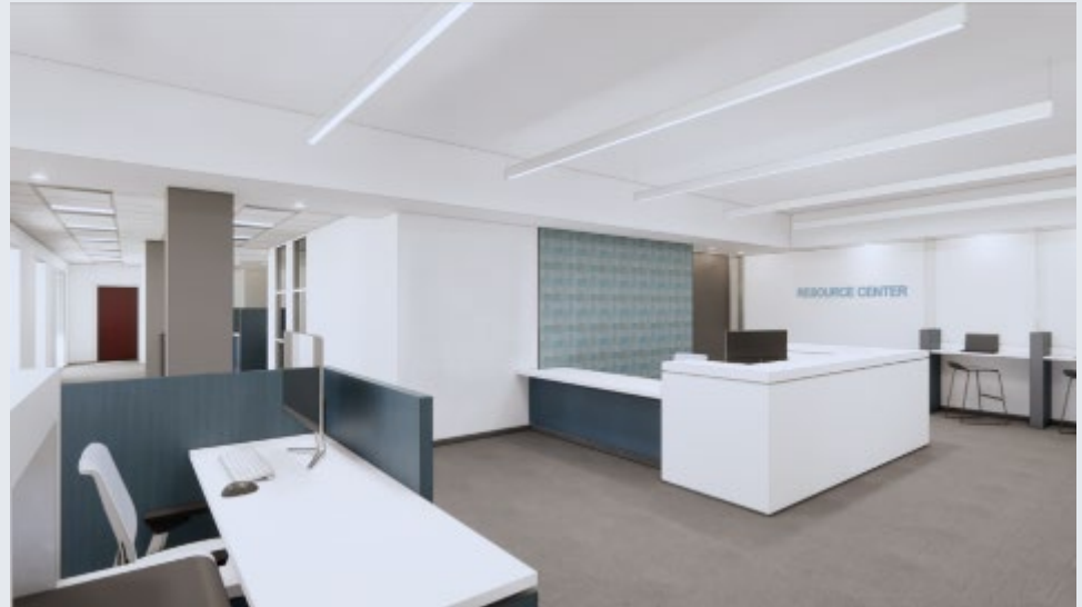
Before/After South Lobby View Looking Northwest