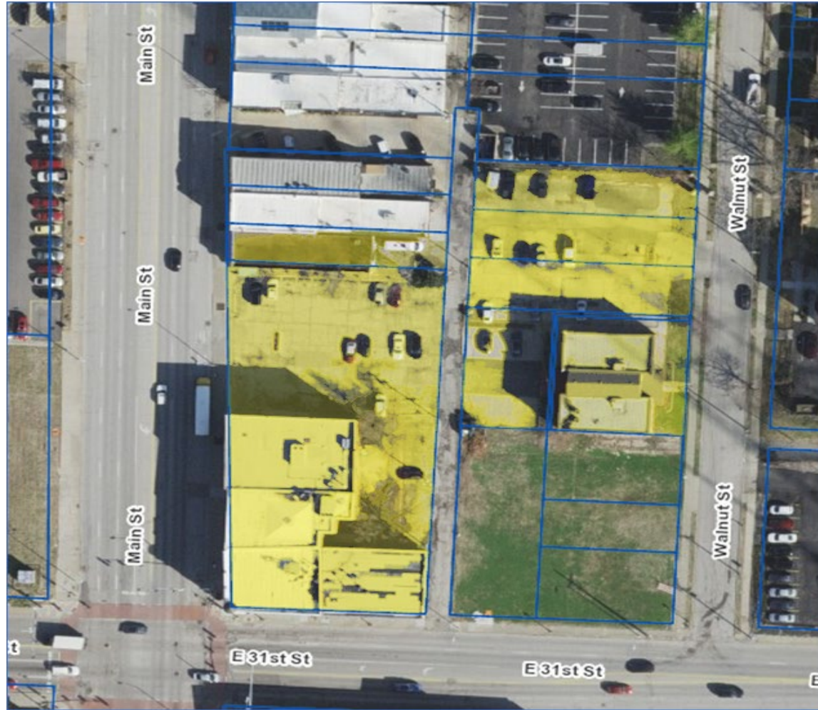
Property Assemblage To Date