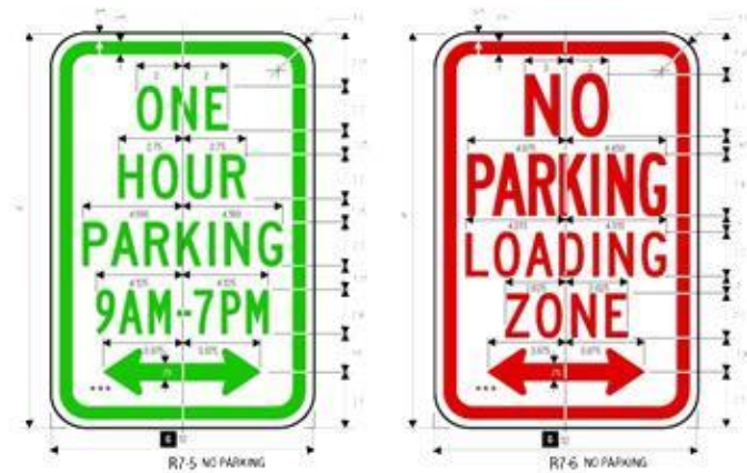
R7-5 NO PARKING

LEGEND - GREEN (RETROREFL) BACKGROUND - WHITE (RETROREFL)