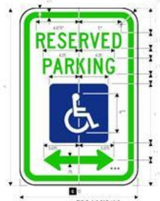
R7-8 NO PARKING

LEGEND - RED (RETROREFL) BACKGROUND - WHITE (RETROREFL)