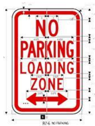
R7-6 NO PARKING

LEGEND - GREEN (RETROREFL) BACKGROUND - WHITE (RETROREFL)