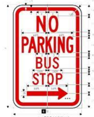
R7-7 NO PARKING

LEGEND - RED (RETROREFL) BACKGROUND - WHITE (RETROREFL)