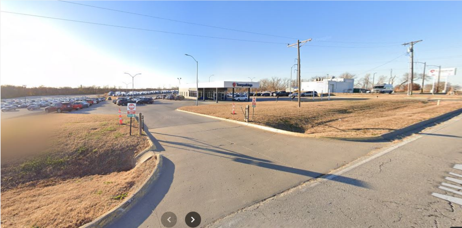
View from NW Prairie View Road