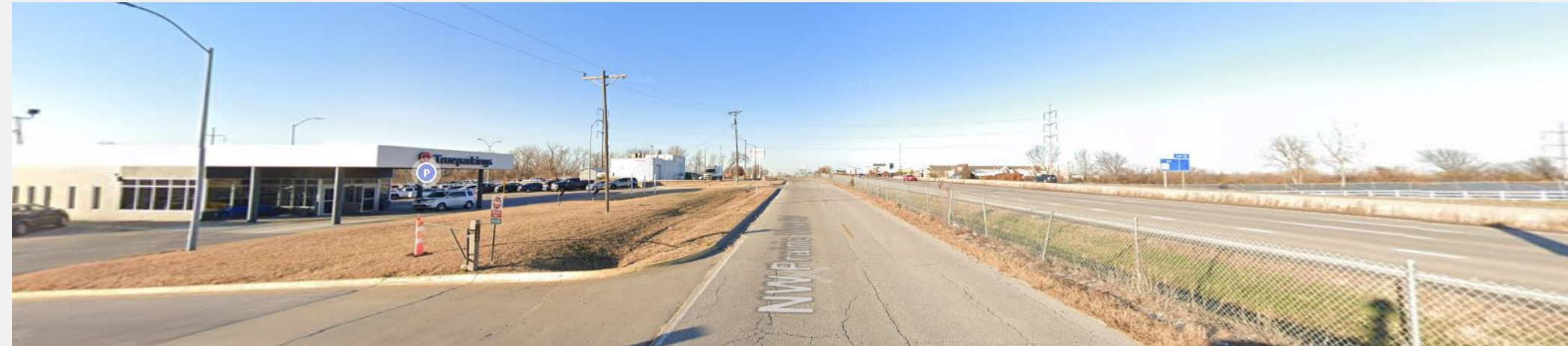
View north from NW Prairie View Road (site on the west of road)