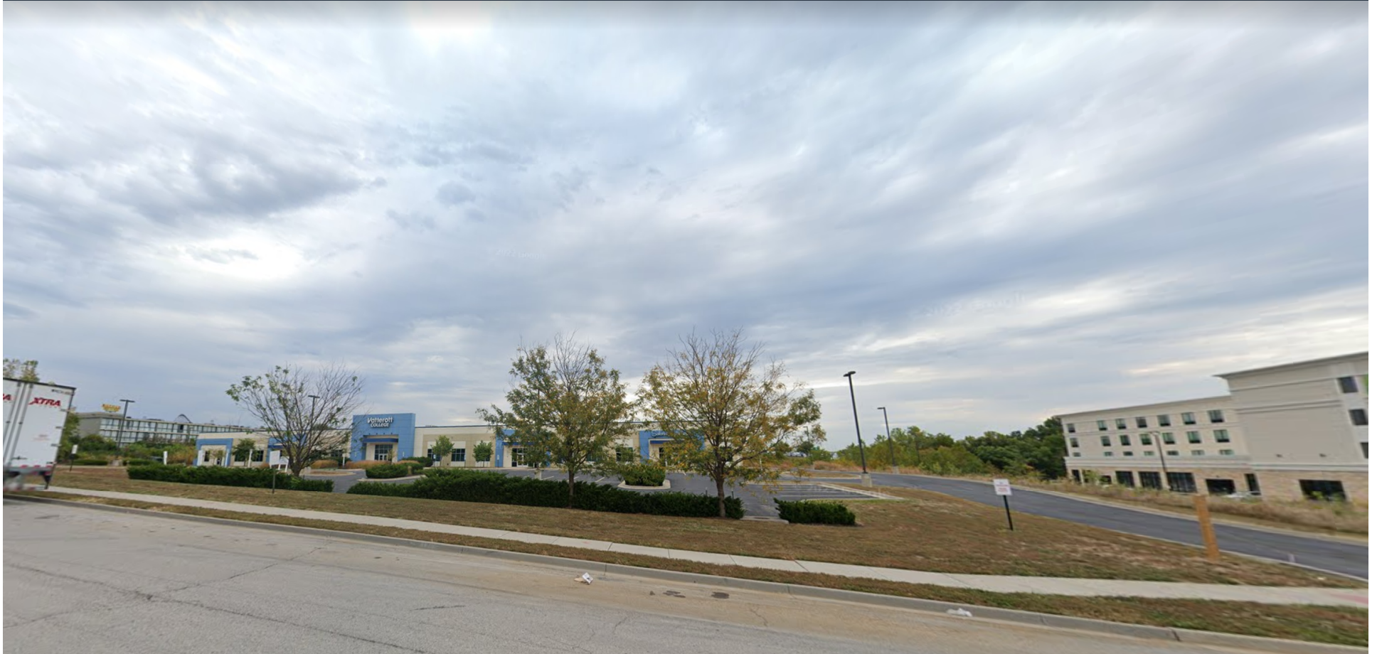
View looking northeast on N. Corrington