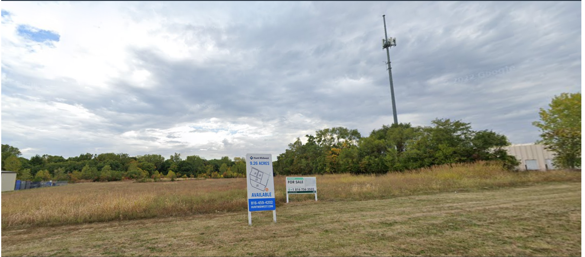
View looking west on N. Corrington