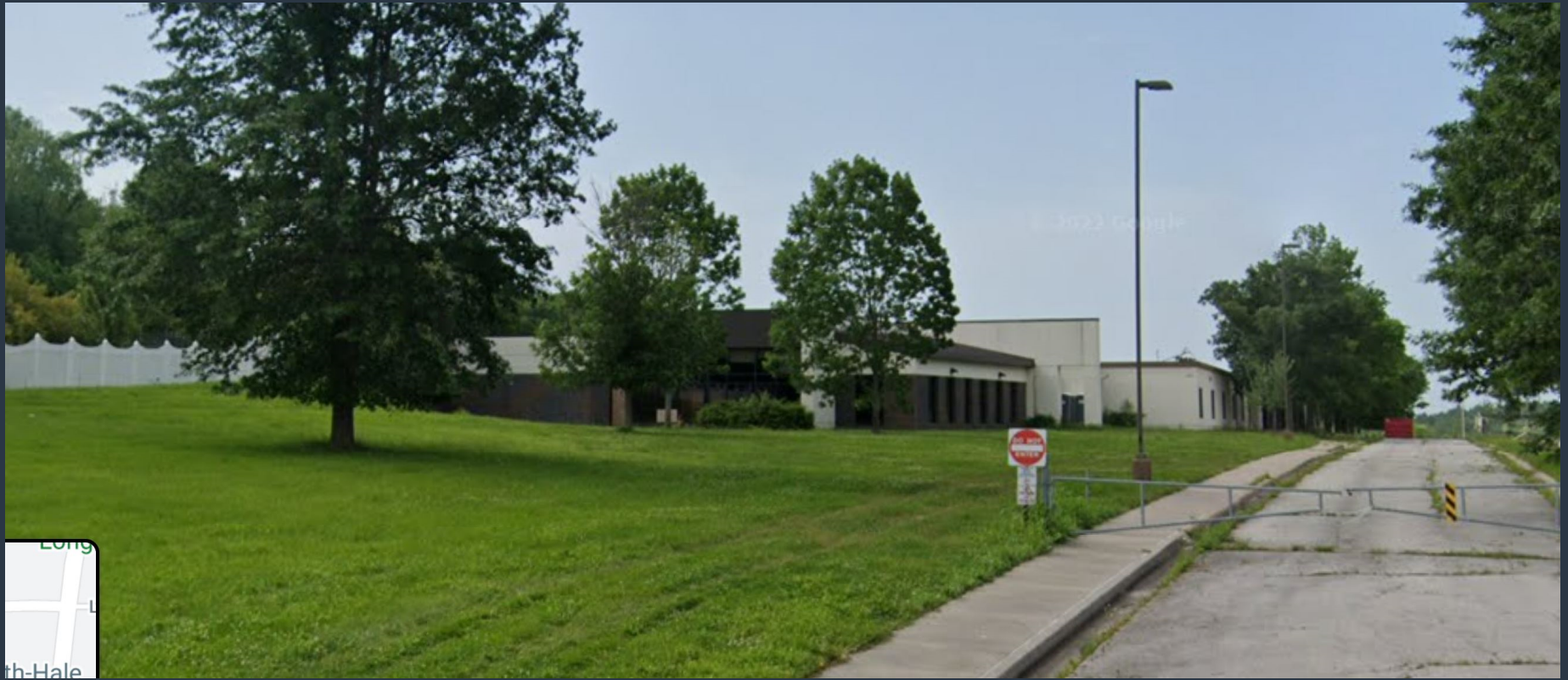
View from Longview Road