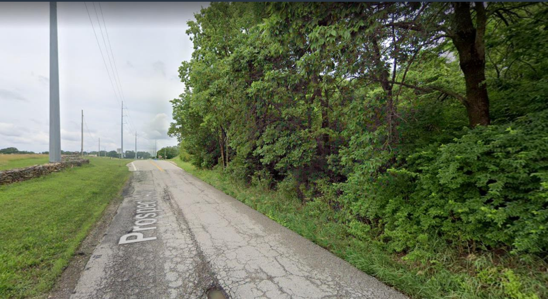
View looking north on Prospect Ave (subject site to the right)