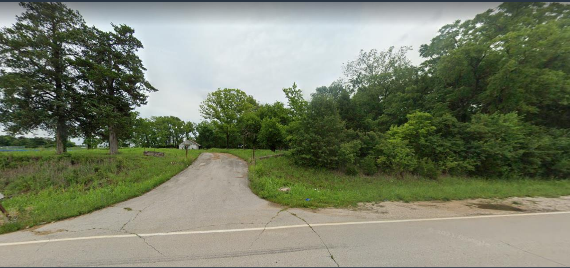
View of existing driveway on subject site from Prospect Ave