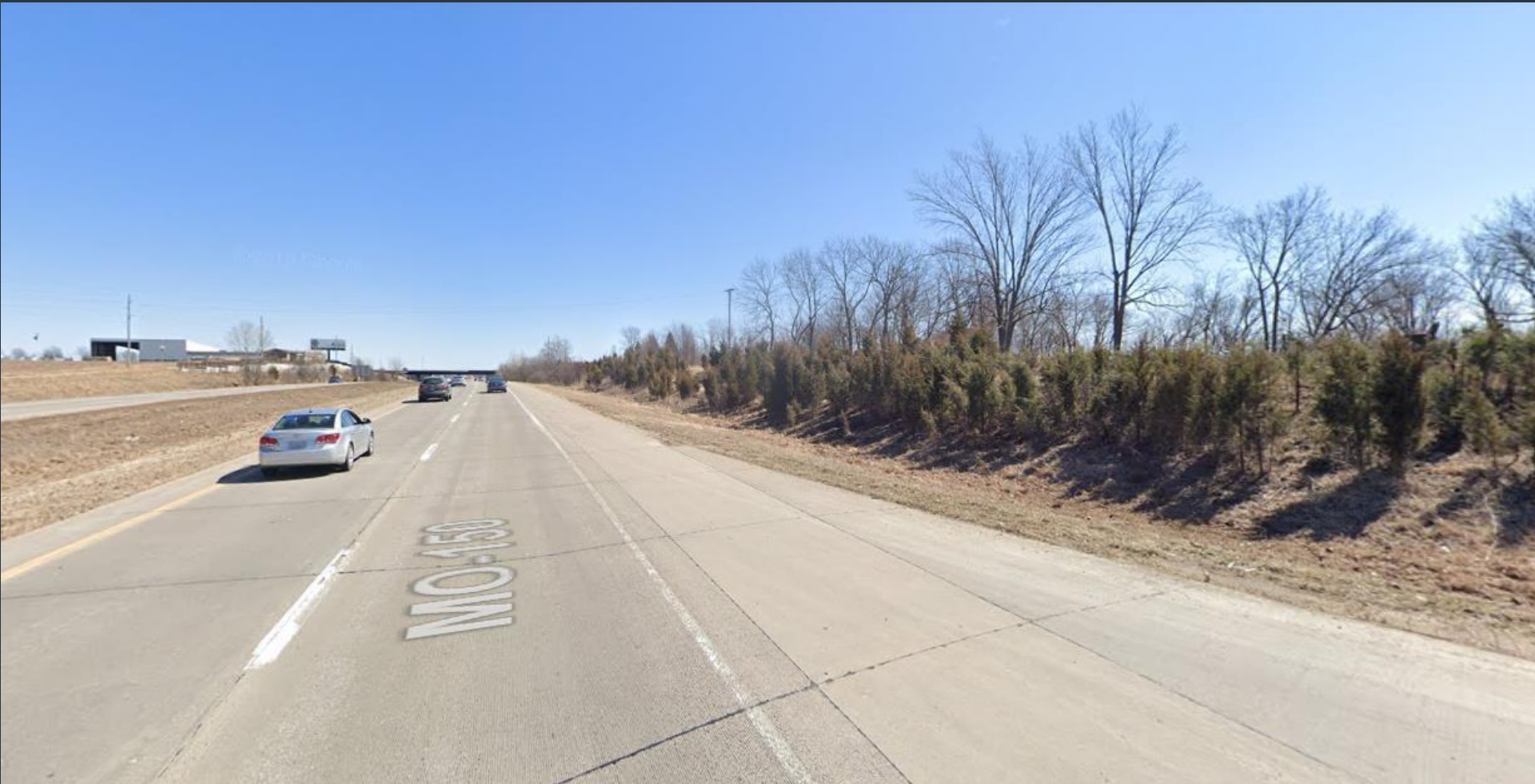
View looking east on Hwy 150 (subject site to the right)